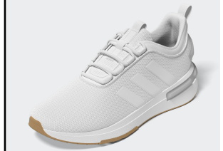
ADIDAS # ID2718 WHITE/GRAY/GUM

RACER TR23: Flextile upper made from 50% recycled content. Rear pull tab for easy entry. Cloudfoam midsole with rubber outsole provides traction and stability.