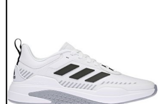
ADIDAS # GX0733 WHITE/BLACK/GRAY

TRAINER V: Flexible knit upper with stretch. Snug feel. Bounce midsole. Rubber outsole. Upper contains a minimum of 50% recycled content.