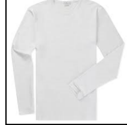
MBS # J29LS WHITE

L.S. T-SHIRT: Preshrunk 50% cotton, 50% polyester jersey. 5.6-oz. Seamless body and crew neck. Ribbed cuffs. Shoulder-to-shoulder taping. Double needle bottom hem. Ship Wt. 32oz. Privil: A/B-1/SHU-1 Sizes: Men's: M - XL $8.99