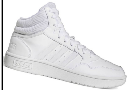
ADIDAS # GW5457 WHITE

HOOPS MID: Basketball-inspired design with a touch of vintage elements. Lace-up design with iconic 3-stripes. Features padded collar and EVA sockliner footbed for ultimate comfort. Sizes: Women's: 5.5-10 $69.99