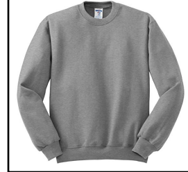
MBS # J5621XGRY LT. GRAY

SWEAT SHIRT: Preshrunk 50% cotton/50% polyester. 8-oz. Spill-resistant fleece. Seamless body with set-in sleeves. Double-needle cover-stitched collar. Ship. Wt. 17oz. Privil. A/B-2, SHU/PSU-2 Sizes: Men's: 2XL - 4XL $19.99