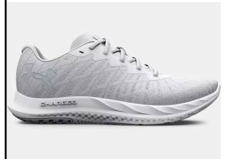
Under Armour # 3026142100 GRAY/WHITE