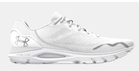
Under Armour # 3026128101 WHITE/SILVER

HOVR SONIC : Breathable, lightweight engineered mesh upper. Delux foam sockliner molds to your foot. Responsive UA HOVR cushioning. Durable rubber outsole.