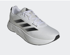
ADIDAS # IE7262 WHITE/BLACK

DURAMO SL: Regular fit. Supportive no-sew overlays. Soft heel. Lightweight cushioning. Rubber outsole. Upper contains a minimum of 50% recycled content.