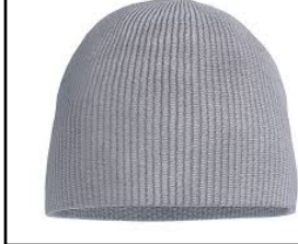
MBS # Y1500GRY GRAY

YUPOONG CAP: Keep a warm head with this sturdy knit cap. 100% hypoallergenic acrylic. Approx. 8 1/2" long. Ship. Wt. 3oz. Privil. A/B-3, SHU/PSU-1 Sizes: One Size Fits Most $6.99