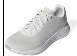
ADIDAS # GY9233 WHITE/GRAY

START YOUR RUN: Running. Designed to support every step and LIGHTMOTION cushioning for high response. Made from a series of recycled materials. Mesh upper.