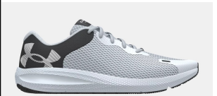
Under Armour # 3024143100 GRAY/BLACK

UA CHR9 PURSUIT 2 BL : Mesh upper. Lightweight & breathable. Strategic support. Foam padding placed around your ankle collar & under the tongue.