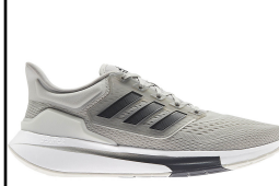
ADIDAS # H68075 GRAY/WHITE/BLACK

EQ21 RUN: Breathable upper that keeps your foot cool. TPU quarter and heel stabilizers to ensure firm stride. Rubber sole.