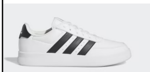
ADIDAS # HP9445 WHITE/BLACK

BREAKNET: Tennis-inspired for anything on or off the court. Synthetic upper is durable, Grippy rubber outsole provides traction on any surface. Partial recycled materials.