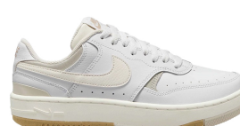
NIKE # DX9176103 WHITE/GUM

GAMMA FORCE: Layers upon layers of style and comfort. Basketball shoes combine suede and synthetic leathers in a new take on the classic AF-1 silhouette.