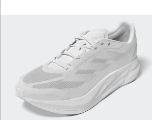
ADIDAS # IE9671 WHITE/GRAY