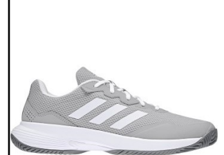
ADIDAS # GW2992 GRAY/WHITE

GAME COURT 2: Breathable, flexible mesh upper. Cushioned EVA foam midsole Extra padding in heel. Durability & Traction. Adiwear outsole offers the ultimate high-wear