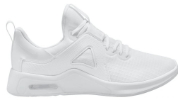
NIKE # DD9285100 WHITE

AIR MAX BELLA: Visible Air. Flat sole that lends a stabilizing advantage for your workout. Updated design increases the containment and support of your foot.