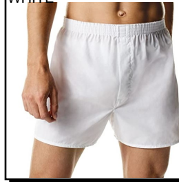
MBS # MB234WHTX WHITE

BOXER: 3 PPK. Cotton/Polyester bland. Relax fit. Fly front. No bunching. Soft, flexible waist band. Shipping Wt. 32oz, Privil: A/B-1/SHU-1 Sizes: Men's: 2XL - 4XL $18.99