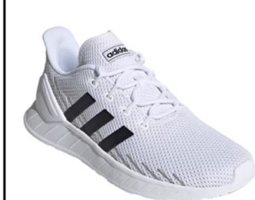
ADIDAS # FY9560 WHITE/BLACK

QUESTAR FLOW: Breathable knit upper with padded collar and textile lining. Lightweight Cloudfoam midsole and outsole. Molded heel counter. Shipping Wt. 32oz, Privil: A/B-1/SHU-1 Sizes: Men's: 7-12,13,14 $74.99