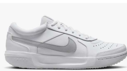
NIKE # DV3279102 WHITE/GRAY

ZOOM COURT LITE III: Mesh and Leather upper. Zoom Air technology in the forefoot for propulsion. Updated outsole grip. Padded collar for extra comfort and security.