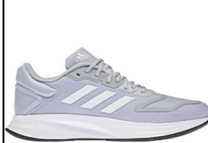
ADIDAS # GW8344 GRAY/WHITE

DURAMO 10: Running shoes. Full-length Lightmotion midsole delivers responsive cushioning. Mesh upper offers elevated comfort from the first step to the last.