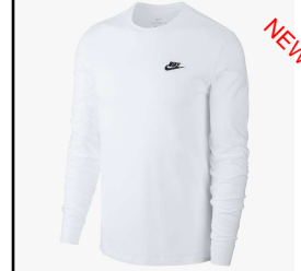
CLOTHING # AR5193100 WHITE

LONG SLEEVE T-SHIRT: Sizes: Men's: S - 4XL $31.99