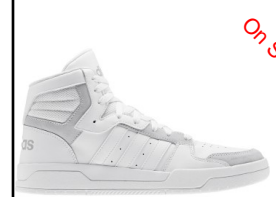
ADIDAS # FW3457 WHITE/SUEDE