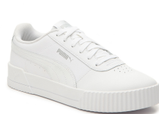
Puma # 38584902 WHITE/SILVER

CARINA: Leather upper. Lace up entry for secure fit. Padded collar for extra comfort. Logo detail on heel, tongue and upper. SoftFoam for cushioned footbed. Rubber outsole.