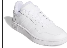
ADIDAS # GW3036 WHITE

HOOPS LOW: Synthetic upper. 3 Stripes logo. Cloudfoam sockliner. Rubber outsole.