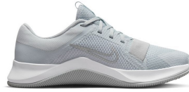
NIKE # DM0824001 GRAY/WHITE

MC TRAINER II: Circuit training. Quick-twitch conditioning. The flat base to help stabilize your foot while you workout. Overlays around the toe and laces add durability. Rubber outsole.