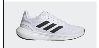
ADIDAS # HP7557 WHITE/BLACK

RUNFALCON: Running shoes. Cushy Cloudfoam midsole. Textile upper is breathable, Rubber outsole gives you plenty of grip for a confident stride. 50% recycled content.