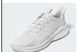
ADIDAS # IF7291 WHITE

ALPHAEDGE: Bounce midsole energises every step with soft cushioning. Rubber outsole. Made w/ recycled materials. Textile upper.