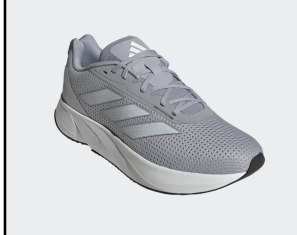
ADIDAS # IE9689 GRAY/WHITE