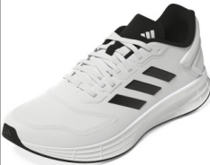
ADIDAS # HQ4130 WHITE/BLACK

DURAMO 10: Versatile running shoes. Cushy Cloudfoam midsole. Textile upper is breathable, and the rubber outsole gives you plenty of grip for a confident stride.