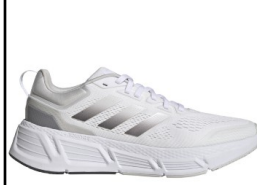
ADIDAS # GZ0630 WHITE/GRAY

QUESTAR: Double-density bounce midsole. Rubber non-marking outsole. Primegreen mesh made with 50% recycled material. Shipping Wt. 32oz, Privil: A/B-1/SHU-1