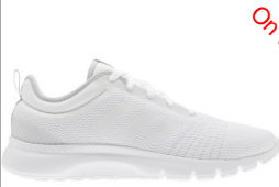
ADIDAS # H01995 WHITE