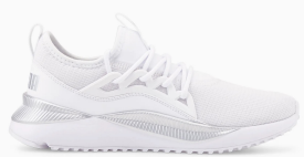
Puma # 38463605 WHITE/GRAY

PACER FUTURE ALLURE: Mesh/synthetic upper. Slip-on. Midfoot lace-through cage EVA midsole. Rubber outsole.