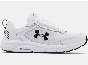
Under Armour # 3024591101 WHITE/BLACK

UA CHR9 ASSERT 9 : Lightweight mesh upper. Durable leather overlays. EVA sockliner. Compression molded foam for responsiveness & durability.