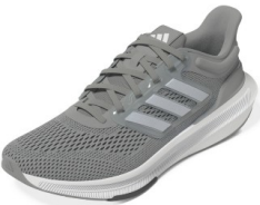
ADIDAS # HP5773 GRAY/WHITE