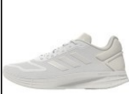
ADIDAS # HP2388 WHITE/GRAY

DURAMO 10: Airy mesh upper keeps is cool and dry. Lightweight, responsive, and sculpted for comfort. adiWEAR outsole offers excellent traction.