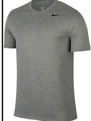
CLOTHING # 718833063 GRAY

SHORT SLEEVE T'S: Dri-FIT. Short-sleeve construction is ideal for a variety of training conditions. Neck tape added for durability and comfort. We may sub: AR6029051, DX0989063 Sizes: Men's: S - 2XL $28.99