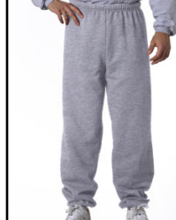
MBS # J9731XGRY LT. GRAY

SWEAT PANTS: Preshrunk 50% cotton/50% polyester, 8-oz. Spill-resistant fleece. Covered elastic waistband. Elastic bottom leg. No pockets. Ship. Wt. 18oz. Privil. A/B-2, SHU/PSU-2 Sizes: Men's: 2XL - 3XL $24.99