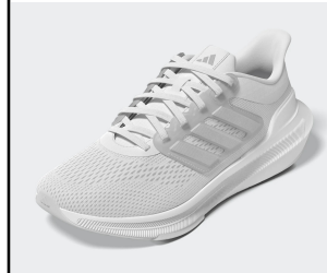
ADIDAS # HP5788 WHITE

ULTRABOUNCE: Availability: February 2024