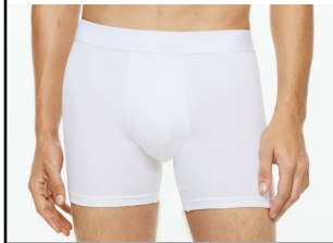
MBS # MBB123WHTX WHITE

BOXER BRIEF: 3 PPK. Comfort flex waistband. Cotton bland. Breathable and Soft. Wide waist band. Functional fly. Shipping Wt. 32oz, Privil: A/B-1/SHU-1 Sizes: Men's: 2X - 4X $18.99