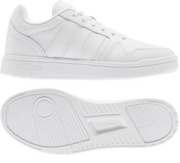
ADIDAS # H00464 WHITE

POSTMOVE: Synthetic leather upper. Cushioned heel. Textile lining. EVA sockliner. Rubber outsole. Tonal 3-Stripe logo. Shipping Wt. 32oz, Privil: A/B-1/SHU-1