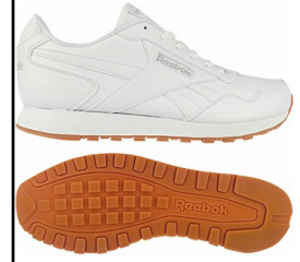
Reebok # CM9940 WHITE/GUM OUTSOLE

CL HARMAN RUN : Leather upper. Brand logo detail hits throughout. Soft fabric lining and footbed. Textured gum rubber outsole. Ship. Wt. 11oz. Privil. A/B-5, SHU/PSU-3