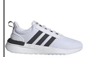
ADIDAS # GZ8182 WHITE/BLACK

RACER TR: Running. Textile upper. Lace-up for a secure fit. Textile lining. Cloud foam midsole for responsive cushioning. Rubber outsole.