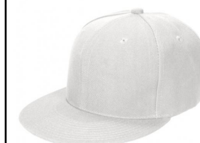
MBS # Y1502WHT WHITE

FLAT BRIM CAP: 6 panel structured cap. 100% Acrylic. Pro style high profile. Rounded flat bill shape. Adjustable snap for a proper fit. Ship. Wt. 4oz. Privil. A/B-3, SHU/PSU-0 Sizes: One Size Fits Most $9.99