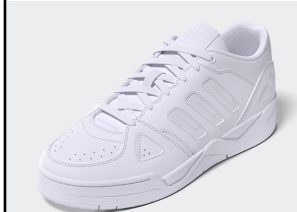
ADIDAS # IF6662 WHITE