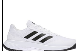
ADIDAS # GW2991 WHITE/BLACK

GAME COURT 2: Lightweight mesh upper and padded heels. Full-length EVA midsole provides a stable and comfortable fit. Durable outsole for traction. EVA midsole.