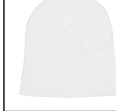
MBS # Y1500WHT WHITE

YUPOONG CAP: Keep a warm head with this sturdy knit cap. 100% hypoallergenic acrylic. Approx. 8 1/2" long. Ship. Wt. 3oz. Privil. A/B-3, SHU/PSU-1 Sizes: One Size Fits Most $6.99