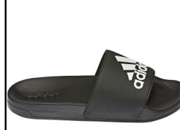
ADIDAS # GZ3779 BLACK/WHITE

ADILETTE SHOWER: Slip on. Synthetic upper. Textile lining. Contoured footbed. Cloudfoam midsole. We may sub. style # CG3425.