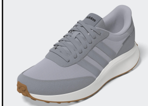
ADIDAS # ID1874 GRY/WT/GUM

RUN 70's: Suede & textile upper. Round toe with bumper. Padded collar & tongue. Textile lining. Cushioned footbed. Foam midsole. Rubber traction sole.