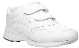
PROPET # W3902W WHITE

VELCRO WALKER: Special Order Item. Leather uppers. Fully Lined. Padded collar & tongue. A5500 Diabetic Approved. ** WIDTH: N, M, W, XW, XXW **