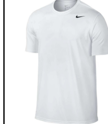
CLOTHING # 718833100 WHITE

SHORT SLEEVE T'S: Dri-FIT. Short-sleeve construction is ideal for a variety of training conditions. Neck tape added for durability and comfort. We may sub: AR6029063, DX0989100 Sizes: Men's: S - 2XL $28.99