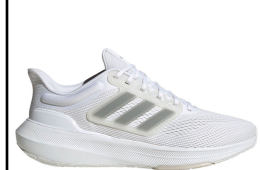
ADIDAS # HP5772 WHITE/GRAY

ULTRA BOUNCE: Lace closure. Textile upper. Bounce midsole. Textile lining. Rubber outsole. Upper contains a minimum of 50% recycled content.