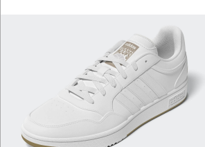
ADIDAS # IF2634 WHITE/GUM

HOOPS 3.0: Low Top Basketball, with an absorbent fabric lining and padded mesh collar. Faux leather upper. Padded collar/tongue. Rubber outsole.