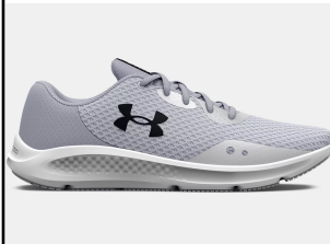
Under Armour # 3024889101 GRAY/WHITE/BLACK

CHARGED PURSUIT : Performance mesh upper. Foam padding placed around your ankle collar & under the tongue. Foam sockliner. Durable outsole pattern for flex & traction.