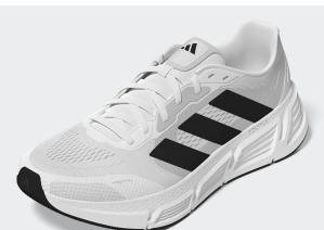
ADIDAS # IF2228 WHITE/BLACK

QUESTAR II: Recycled materials. Lightweight and breathable. Cloudfoam cushioning. A molded heel and lace-up design provide stability. Rubber traction.