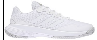
ADIDAS # GW4971 WHITE/GRAY

GAME COURT 2: Running. Mesh upper for breathability. All day comfort. A durable rubber outsole gives you a solid foundation.