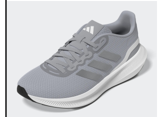
ADIDAS # ID2271 GRAY/WHITE

RUNTALCON 3.0: Availability: November 2023