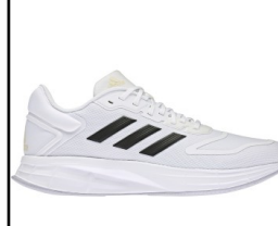
ADIDAS # GW8348 WHITE/BLACK

DURAMO 10: Regular fit. Supportive no-sew overlays. Soft heel. Lightweight cushioning. Rubber outsole. Upper contains a minimum of 50% recycled content.