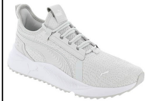
Puma # 39172901 GRAY/WHITE

PACER FUTURE MONO: Textile upper with a 2-tone colored TU. Bootie construction. Lightly cushioned footbed. EVA midsole.