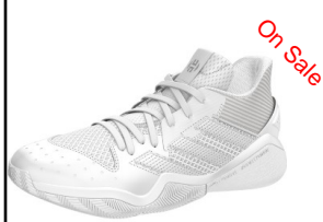
ADIDAS # FW8488 WHITE/GRAY