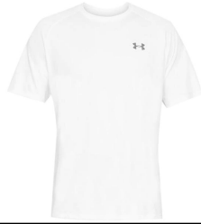
Under Armour # 1005684101 WHITE

TECH T 2.0 SS: 100 % Polyester. Signature Moisture Transport System. Anti-Odor technology. We may sub: 1326799036 Shipping Wt. 32oz, Privil: A/B-1/SHU-1