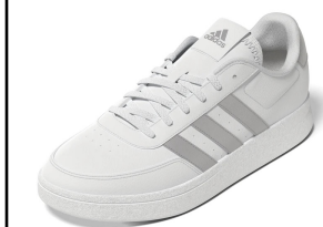
ADIDAS # HP9440 WHITE/GRAY

BREAKNET: Availability: June 2023 Shipping Wt. 32oz, Privil: A/B-1/SHU-1 Sizes: Women's: 6-10 $54.99