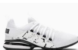
Puma # 37719703 WHITE/BLACK

AXELION MARBLE: Availability: June 2023 Shipping Wt. 32oz, Privil: A/B-1/SHU-1 Sizes: Women's: 5.5-10,11 $79.99