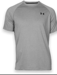
Under Armour # 1228539025 GRAY

TECH T 2.0 SS: 100 % Polyester. Signature Moisture Transport System. Anti-Odor technology. We may sub: 1326799100 Shipping Wt. 32oz, Privil: A/B-1/SHU-1