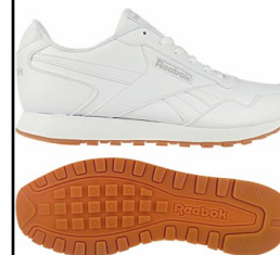
REEBOK # CM9940 WHITE/GUM OUTSOLE

CL HARMAN RUN: Leather upper. Brand logo detail hits throughout. Soft fabric lining and footbed. Textured gum rubber outsole. Ship. Wt. 11oz. Privil: A/B-5, SHU/PSU-3 Sizes: Women's: 5-9.5 $49.99