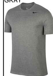
CLOTHING # 718833063 GRAY

SHORT SLEEVE T'S: Dri-FIT. Short-sleeve construction is ideal for a variety of training conditions. Neck tape added for durability and comfort. We may sub: AR6029051, DX0989063