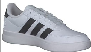
ADIDAS # HP9445 WHITE/BLACK

BREAKNET: Availability: June 2023 Shipping Wt. 32oz, Privil: A/B-1/SHU-1 Sizes: Women's: 6-10 $54.99