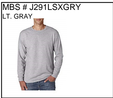
L.S. T-SHIRT: Preshrunk 50% cotton, 50% polyester. 5.6-oz. Seamless body and crew neck. Ribbed cuffs. Shoulder-to-shoulder taping. Double needle bottom hem. Ship. Wt. 13oz. Privil. A/B-5, SHU/PSU-3