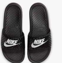
NIKE # 343881011 BLACK/WHITE

BENASSI JDI SANDAL: One-piece injected Phylon sports massage slide for the ultimate in lightweight comfort at an incredible price. (WHOLE SIZES ONLY). Shipping Wt. 32oz, Privil: A/B-1/SHU-1 Sizes: Women's: 5-11 $22.99