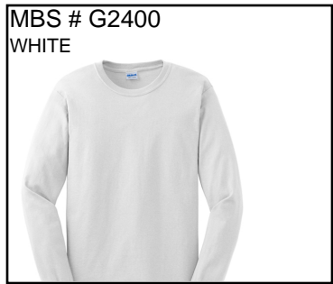
L.S. T-SHIRT: Preshrunk. 100% cotton jersey, 6-oz. double-needle 7/8" collar. Taped neck & shoulders. Rib-knit cuffs. Double-needle bottom hem. Ship Wt. 32oz, Privil: A/B-1/SHU-1