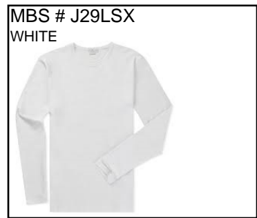
L.S. T-SHIRT: Preshrunk 50% cotton, 50% polyester jersey. 5.6-oz. Seamless body and crew neck. Ribbed cuffs. Shoulder-to-shoulder taping. Double needle bottom hem. Ship Wt. 32oz. Privil: A/B-1/SHU-1