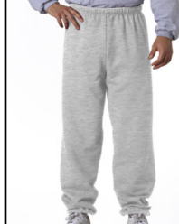
MBS # J973XASH ASH

SWEAT PANTS: Preshrunk 50% cotton/50% polyester, 8-oz. Spill-resistant fleece. Covered elastic waistband. Elastic bottom leg. No pockets. Ship. Wt. 18oz. Privil. A/B-2, SHU/PSU-2 Sizes: Men's: 2XL - 3XL $24.99