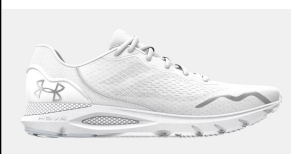
Under Armour # 3026128101 WHITE/SILVER

HOVR SONIC: Availability: June 2023 Shipping Wt. 32oz, Privil: A/B-1/SHU-1 Sizes: Women's: 6-10 $94.99