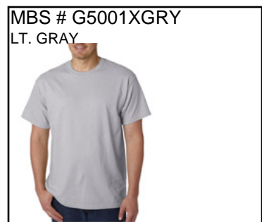
S.S. T-SHIRT: Preshrunk. 100% cotton jersey. 6-oz. double-needle 7/8" collar. Taped neck and shoulders. Double-needle bottom hem. Ship. Wt. 11oz. Privil. A/B-5, SHU/PSU-3