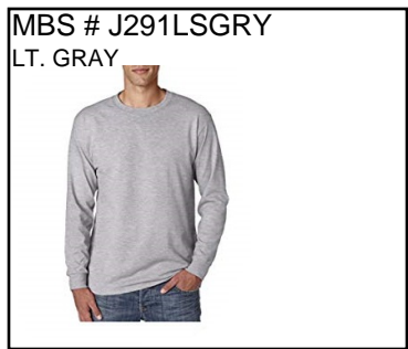
L.S. T-SHIRT: Preshrunk 50/50 cotton/polyester. 5.6-oz. Seamless body and crew neck. Ribbed cuffs. Shoulder-to-shoulder taping. Double needle bottom hem. Ship. Wt. 13oz. Privil. A/B-5, SHU/PSU-3