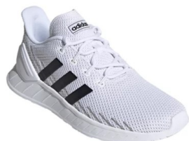
ADIDAS # FY9560 WHITE/BLACK

QUESTAR FLOW: Breathable knit upper with padded collar and textile lining. Lightweight Cloudfoam midsole and outsole. Molded heel counter. Shipping Wt. 32oz, Privil: A/B-1/SHU-1 Sizes: Men's: 7-12,13,14 $74.99