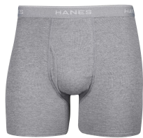
MBS # MBB123GRYX GRAY

BOXER BRIEF: 3 PPK. Comfort flex waistband. Cotton bland. Breathable and Soft. Wide waist band. Functional fly. Shipping Wt. 32oz, Privil: A/B-1/SHU-1