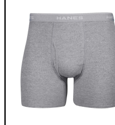
MBS # MBB123GRY GRAY

BOXER BRIEF: 3 PPK. Comfort flex waistband. Cotton bland. Breathable and Soft. Wide waist band. Functional fly. Shipping Wt. 32oz, Privil: A/B-1/SHU-1 Sizes: Men's: M - XL $16.99