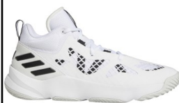
ADIDAS # GW0147 WHITE/BLACK

PRO N3NT 2021: Rubber sole. Lightweight, indoor B-ball shoes with a locked-down feel. Textile upper offers durability and comfort. Shipping Wt. 32oz, Privil: A/B-1/SHU-1 Sizes: Men's: 7-12,13 $74.99