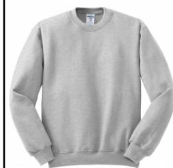
MBS # J562ASH ASH

SWEAT SHIRT: Preshrunk 50% cotton/50% polyester. 8-oz. Spill-resistant fleece. Seamless body with set-in sleeves. Double-needle cover-stitched collar. Ship. Wt. 17oz. Privil. A/B-2, SHU/PSU-2 Sizes: Men's: M - XL $14.99