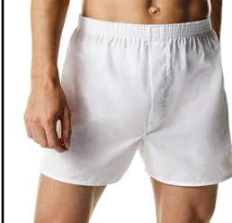
MBS # MB234WHT WHITE

BOXER: 3 PPK. Cotton/Polyester bland. Relax fit. Fly front. No bunching. Soft, flexible waist band. Shipping Wt. 32oz, Privil: A/B-1/SHU-1 Sizes: Men's: S - XL $14.99