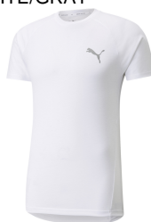
Puma # 52031402 WHITE/GRAY

PERFORMANCE T's: 100 % Polyester. Signature Moisture Transport System. Anti-Odor technology. Shipping Wt. 32oz, Privil: A/B-1/SHU-1