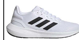
ADIDAS # HP7557 WHITE/BLACK

RUN FALCON: Availability: June 2023 Shipping Wt. 32oz, Privil: A/B-1/SHU-1 Sizes: Women's: 5-10,11 $54.99