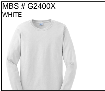
L.S. T-SHIRT: Preshrunk. 100% cotton jersey, 6-oz. double-needle 7/8" collar. Taped neck & shoulders. Rib-knit cuffs. Double-needle bottom hem. Ship Wt. 32oz, Privil: A/B-1/SHU-1