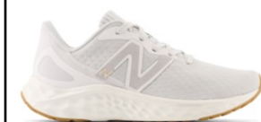
NB # WARISEG4 WHITE/GUM

ARISEG4: Fresh Foam midsole cushioning to deliver an ultra-cushioned, lightweight runner. Mesh upper w/ no-sew overlays for a sleek fit and feel. Rubber Outsole, Shipping Wt. 32oz, Privil: A/B-1/SHU-1 Sizes: Women's: 5-10,11 $69.99