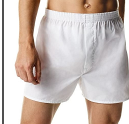
MBS # MB234WHTX WHITE

BOXER: 3 PPK. Cotton/Polyester bland. Relax fit. Fly front. No bunching. Soft, flexible waist band. Shipping Wt. 32oz, Privil: A/B-1/SHU-1 Sizes: Men's: 2XL - 4XL $18.99