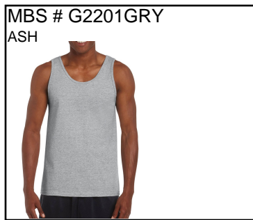
TANK TOP: Preshrunk. 100% cotton jersey. 6-oz. Banded neck and armholes. Double-needle bottom hem. Ship. Wt. 10oz. Privil. A/B-5, SHU/PSU-3