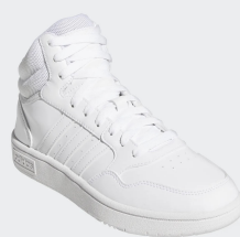
ADIDAS # GW5457 WHITE

HOOPS MID: Availability: June 2023 Shipping Wt. 32oz, Privil: A/B-1/SHU-1 Sizes: Women's: 5.5-10 $69.99