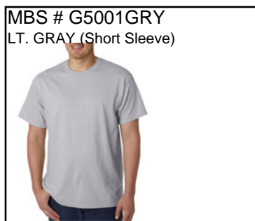
S.S. T-SHIRT: Preshrunk. 100% cotton jersey. 6-oz. double-needle 7/8" collar. Taped neck and shoulders. Double-needle bottom hem. Ship. Wt. 11oz. Privil. A/B-5, SHU/PSU-3