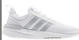
ADIDAS # H00647 WHITE/GRAY

RACER TR21: Running. Lightweight midsole provides all-day cushioning underfoot. Made from recycled high performance materials. Textile upper. Shipping Wt. 32oz, Privil: A/B-1/SHU-1 Sizes: Women's: 5-10,11 $69.99