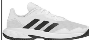
ADIDAS # GW2984 WHITE/BLACK

COURT JAM CONTROL: Flexible Bounce midsole. Breathable mesh upper. Non-marking hard court outsole and stabilizing Torsion System. Shipping Wt. 32oz, Privil: A/B-1/SHU-1 Sizes: Men's: 8-12,13 $84.99