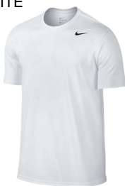
CLOTHING # 718833100 WHITE

SHORT SLEEVE T'S: Dri-FIT. Short-sleeve construction is ideal for a variety of training conditions. Neck tape added for durability and comfort. We may sub: AR6029063, DX0989100