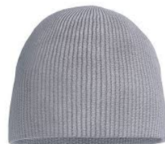
MBS # Y1500GRY GRAY

YUPOONG CAP: Keep a warm head with this sturdy knit cap. 100% hypoallergenic acrylic. Approx. 8 1/2" long. Ship. Wt. 3oz. Privil. A/B-3, SHU/PSU-1