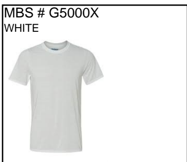
S.S. T-SHIRT: Preshrunk. 100% cotton jersey. 6-oz. double-needle 7/8" collar. Taped neck and shoulders. Double-needle bottom hem. Ship Wt. 32oz, Privil: A/B-1/SHU-1