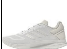
ADIDAS # HP2388 WHITE/GRAY

DURAMO 10: Availability: June 2023 Shipping Wt. 32oz, Privil: A/B-1/SHU-1 Sizes: Women's: 5-10,11 $64.99