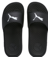
Puma # 37101604 BLACK/WHITE

COOL CAT SPORT: WHOLE SIZES ONLY Shipping Wt. 32oz, Privil: A/B-1/SHU-1 Sizes: Women's 5-11 $29.99