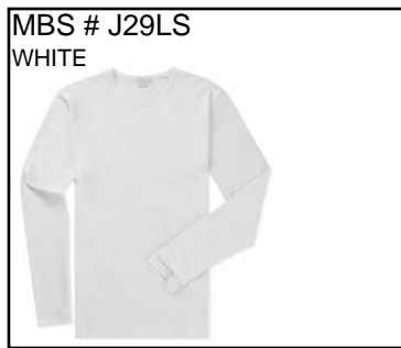
L.S. T-SHIRT: Preshrunk 50% cotton, 50% polyester jersey. 5.6-oz. Seamless body and crew neck. Ribbed cuffs. Shoulder-to-shoulder taping. Double needle bottom hem. Ship Wt. 32oz. Privil: A/B-1/SHU-1