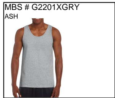
TANK TOP: Preshrunk. 100% cotton jersey. 6-oz. Banded neck and armholes. Double-needle bottom hem. Ship. Wt. 10oz. Privil. A/B-5, SHU/PSU-3