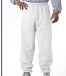
MBS # J9732XWHT WHITE

SWEAT PANTS: Preshrunk 50% cotton/50% polyester, 8-oz. Spill-resistant fleece. Covered elastic waistband. Elastic bottom leg. No pockets. Shipping Wt. 32oz, Privil: A/B-1/SHU-1 Sizes: X-Gender: 2XL - 3XL $24.99