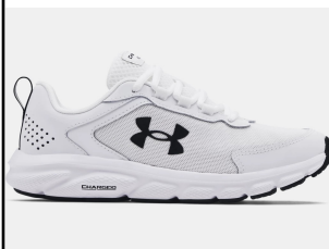
Under Armour # 3024591101 WHITE/BLACK

UA CHR9 ASSERT 9: Lightweight mesh upper. Durable leather overlays. EVA sockliner. Compression molded foam for responsiveness & durability. Shipping Wt. 32oz, Privil: A/B-1/SHU-1 Sizes: Women's: 5-10 $64.99