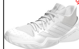
ADIDAS # FW8488 WHITE/GRAY

HARDEN STEPBACK: On SALE - Supply Limited to Size: 7.5, 8, 8.5, 9.5, 11, 11.5 ONLY Shipping Wt. 32oz, Privil: A/B-1/SHU-1 Sizes: Men's: See Above. $49.99