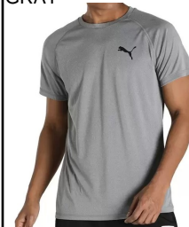
Puma # 58718403 GRAY

SS Performance Tee: 100 % Polyester. Signature Moisture Transport System. Anti-Odor technology. Shipping Wt. 32oz, Privil: A/B-1/SHU-1