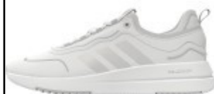
ADIDAS # HP9839 WHITE/GRAY

FUKASA RUN: Availability: June 2023 Shipping Wt. 32oz, Privil: A/B-1/SHU-1 Sizes: Women's: 6-10 $58.99