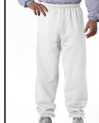
MBS # J9732WHT WHITE

SWEAT PANTS: Preshrunk 50% cotton/50% polyester, 8-oz. Spill-resistant fleece. Covered elastic waistband. Elastic bottom leg. No pockets. Ship. Wt. 18oz. Privil. A/B-2, SHU/PSU-2 Sizes: X-Gender: M - XL $18.99