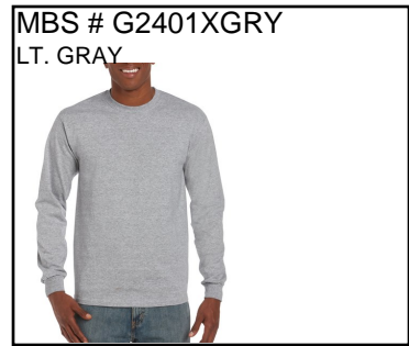
L.S. T-SHIRT: Long Sleeve. Preshrunk 100% cotton jersey, 6-oz. double-needle 7/8" collar. Taped neck and shoulders. Rib-knit cuffs. Ship. Wt. 13oz. Privil. A/B-5, SHU/PSU-3