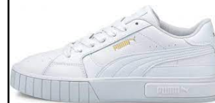
Puma # 38017601 WHITE

CALI STAR: Availability: June 2023 Shipping Wt. 32oz, Privil: A/B-1/SHU-1 Sizes: Women's: 5.5-10,11 $79.99