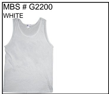
TANK TOP: Preshrunk. 100% cotton jersey. 6-oz. Banded neck and armholes. Double-needle bottom hem. Shipping Wt. 32oz, Privil: A/B-1/SHU-1