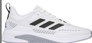
ADIDAS # GX0733 WHITE/BLACK/GRAY

TRAINER V: Flexible knit upper with stretch. Snug feel. Bounce midsole. Rubber outsole. Upper contains a minimum of 50% recycled content. Shipping Wt. 32oz, Privil: A/B-1/SHU-1 Sizes: Men's: 6.5-12,13,14 $79.99