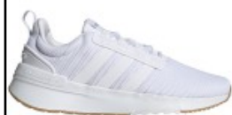
ADIDAS # GX4207 WHITE/GUM

RACER TR21: Racing sneakers features classic 3-Stripes. Lace-up vamp. Synthetic upper/rubber sole. Shipping Wt. 32oz, Privil: A/B-1/SHU-1 Sizes: Women's: 5-10,11 $74.99