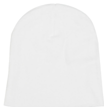
MBS # Y1500WHT WHITE

YUPOONG CAP: Keep a warm head with this sturdy knit cap. 100% hypoallergenic acrylic. Approx. 8 1/2" long. Ship. Wt. 3oz. Privil. A/B-3, SHU/PSU-1