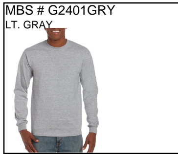
L.S. T-SHIRT: Long Sleeve. Preshrunk 100% cotton jersey, 6-oz. double-needle 7/8" collar. Taped neck and shoulders. Rib-knit cuffs. Ship. Wt. 13oz. Privil. A/B-5, SHU/PSU-3