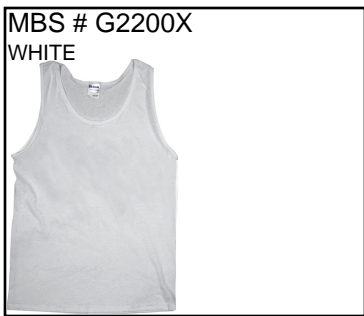
TANK TOP: Preshrunk. 100% cotton jersey. 6-oz. Banded neck and armholes. Double-needle bottom hem. Shipping Wt. 32oz, Privil: A/B-1/SHU-1