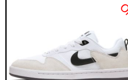
NIKE # CQ0369100 WHITE/BLACK

SB ALLEY HOOP: Supply Limited to Size: 5.5, 6, 6.5, 8.5, 9, 10 Shipping Wt. 32oz, Privil: A/B-1/SHU-1 Sizes: Women's: See Above $49.99