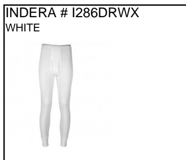
INDERA # I286DRWX WHITE

ICETEX: 7.5 oz. 100% HydroPur Inside - 100% Cotton Outside. Heavyweight. Wicks moisture. Added cotton for comfort. Scent blocking. Rib cuffs. Ship. Wt. 18oz. Privil. A/B-2, SHU/PSU-2