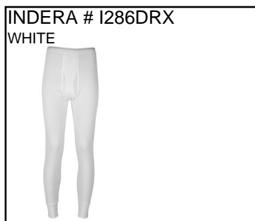
INDERA # I286DRX WHITE

LONG JOHN TALL TOP: 9.1 oz. Rated for Extreme Cold. Rib Cuffs. 50% Cotton/50% Polyester. Ship. Wt. 18oz. Privil. A/B-2, SHU/PSU-2