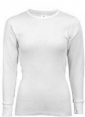
INDERA # I287LSWX WHITE

ICETEX - TOP: Thermal Underwear 8.0 oz. 100% HydroPur Inside, 100% Cotton Outside. Heavyweight. Wicks moisture. Added cotton for comfort. Scent blocking. Rib cuffs.