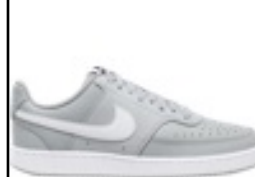
NIKE # CD5463003 GRAY/WHITE/BLACK

COURT VISION LOW: Retro Hoops 1980's inspiration. Basketball shoes. Vulcanized construction fuses the outsole to midsole for a streamlined look that's durable and comfortable.