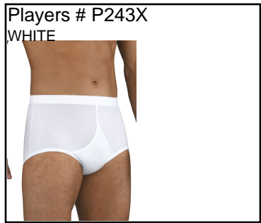
Players # P243X WHITE

NYLON BRIEF: 100 % Nylon quality fabric. Machine wash warm. Made with lightweight, fast-drying fabric. Full coverage fit. Made in the USA