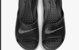
NIKE # CZ5478001 BLACK

VICTORI ONE : Contoured foam adds total comfort, while iconic Nike branding gives these sandals a dash of heritage athletic style. Vented for water to go thru the shoe.