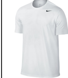
CLOTHING # 718833100 WHITE

SHORT SLEEVE T'S: Dri-FIT. Short-sleeve construction is ideal for a variety of training conditions. Neck tape added for durability and comfort.