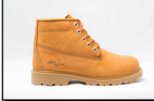
MIKE'S # 1068-100 TAN NUBUCK

5" BOOT WP: Leather upper. Solid, light weight n flexible. Oil and abrasion resistant. Padded collar. Fully lined. Cushion insole. Waterproof. No size 7,8,10,11,12