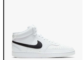
NIKE # CD5466101 WHITE/BLACK

COURT VISION MID: Baby brother to Air Force 1. Stitching at the vamp and panels. Leather upper. Padded tongue and collar. Mesh lining.