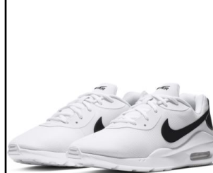
NIKE # AQ2235100 WHITE/BLACK

AIR MAX OKETO: Comfortable cushioning of a Max Air unit. Its clean and simple mesh upper is elevated by subtle design details referencing iconic Air Max.