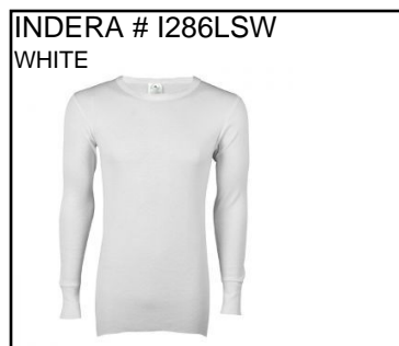
INDERA # I286LSW WHITE

ICETEX: 100% HydroPur Inside - 100% Cotton Outside. Heavyweight. Wicks moisture. Added cotton for comfort. Scent blocking. Rib cuffs. 8.0 oz Ship. Wt. 18oz. Privil. A/B-2, SHU/PSU-2