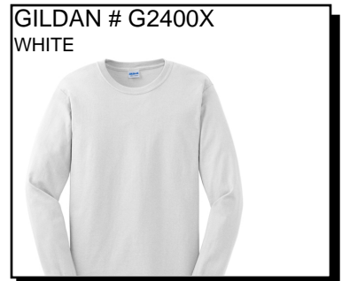
GILDAN # G2400X WHITE

L.S. T-SHIRT: Preshrunk. 100% cotton jersey, 6-oz. double-needle 7/8" collar. Taped neck & shoulders. Rib-knit cuffs. Double-needle bottom hem. Ship. Wt. 13oz. Privil. A/B-5, SHU/PSU-3