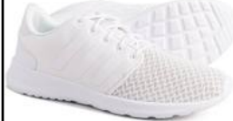
ADIDAS # FW7285 WHITE

QT RACER 2.0: Running-inspired shoes offer a clean look for everyday wear. Soft cushioning provides plush step-in comfort. The textile upper offers a modern look.