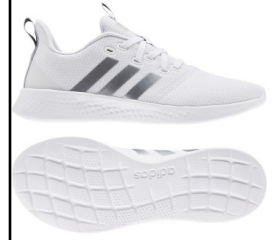
ADIDAS # FW3264 WHITE/SILVER

PURE MOTION: Cushy, comfy and ultra-breathable. Pure motion casual sneakers. Inspired by performance running. Wt. 32oz, Privil: A/B-1/SHU-1.