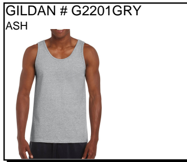
GILDAN # G2201GRY ASH

TANK TOP: Preshrunk. 100% cotton jersey. 6-oz. Banded neck and armholes. Double-needle bottom hem. Ship. Wt. 10oz. Privil. A/B-5, SHU/PSU-3