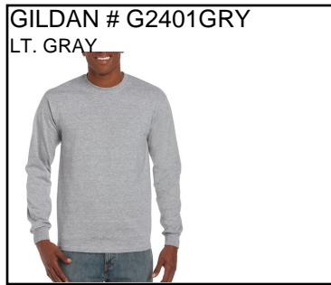
GILDAN # G2401GRY LT. GRAY

L.S. T-SHIRT: Long Sleeve. Preshrunk 100% cotton jersey, 6-oz. double-needle 7/8" collar. Taped neck and shoulders. Rib-knit cuffs. Ship. Wt. 13oz. Privil. A/B-5, SHU/PSU-3