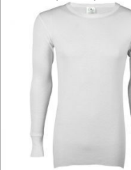
INDERA # I888LSTX WHITE (TALL)

LONG JOHN TALL TOP: 9.1 oz. Rated for Extreme Cold. Rib Cuffs. 50% Cotton/50% Polyester. Ship. Wt. 18oz. Privil. A/B-2, SHU/PSU-2