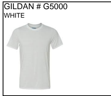
GILDAN # G5000 WHITE

S.S. T-SHIRT: Preshrunk. 100% cotton jersey. 6-oz. double-needle 7/8" collar. Taped neck and shoulders. Double-needle bottom hem. Ship. Wt. 11oz. Privil. A/B-5, SHU/PSU-3