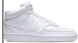
NIKE # CD5436100 WHITE

COURT VISION MID: Mid-top leather sneakers feature a breathable, perforated toe box. Nike Swoosh® logo at side. Retro sneakers rep a throwback from the 80's.