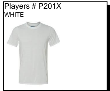
Players # P201X WHITE

COTTON CREW TEE: 100% combed cotton material shrink resistant. Machine wash warm. Made in the USA. 2 PCS/PKG.