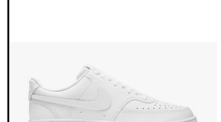
NIKE # CD5463100 WHITE

COURT VISION LOW: Retro Hoops 1980's inspiration. Basketball shoes. Vulcanized construction fuses the outsole to midsole for a streamlined look that's durable and comfortable.