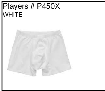
Players # P450X WHITE

BOXER: 50% cotton and 45% polyester. Shrink resistant, machine wash warm. Made in the USA. 2 PCS/PKG.