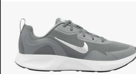
NIKE # CJ1682006 GRAY/WHITE

WEAR ALL DAY : Mesh & synthetic upper. Padded tongue & collar. Ventilated. Cushioned footbed and rubber waffle outsole add even more comfort and traction.