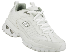
SKECHERS # 50081W WHITE/GRAY

AFTERBURN: Soft leather upper for breathability and comfort. Rubber outsole, EVA midsole for durability. ** Width: M, XW ** Availability: December 2021