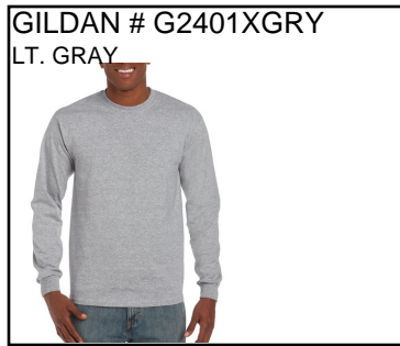
GILDAN # G2401XGRY LT. GRAY

L.S. T-SHIRT: Long Sleeve. Preshrunk 100% cotton jersey, 6-oz. double-needle 7/8" collar. Taped neck and shoulders. Rib-knit cuffs. Ship. Wt. 13oz. Privil. A/B-5, SHU/PSU-3