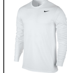
NIKE # 718837100 WHITE