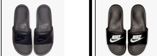
NIKE # 343880090 BLACK/WHITE

BENASSI: Just Do It Slide Sandal. Lightweight, Synthetic upper. One piece synthetic strap. (WHOLE SIZES ONLY).