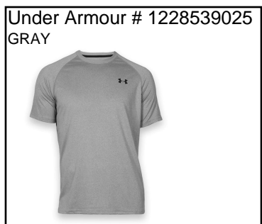
Under Armour # 1228539025 GRAY

TECH T 2.0 SS: 100 % Polyester. Signature Moisture Transport System. Anti-Odor technology. Ship. Wt. 11oz. Privil. A/B-5, SHU/PSU-3