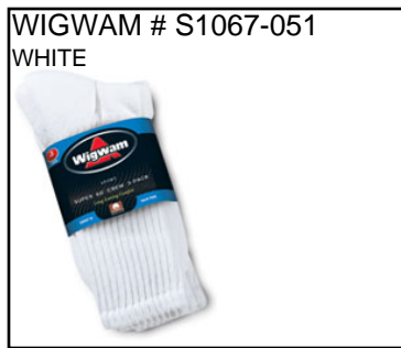
WIGWAM # S1067-051 WHITE

SUPER 60 CREW: Cotton athletic sock in crew length. Welt top. Cushion sole. 3x1 moc rib. 3 pair per pack. 85% cotton, 15% stretch nylon.