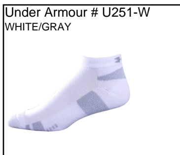
Under Armour # U251-W WHITE/GRAY

LO CUT: A soft and supple Spandex blend of nylon, polyester, and Lycra. Designed to conform to the shape of your foot. Priced individually.