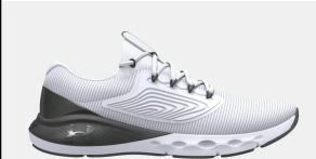
Under Armour # 3025357100 WHITE/BLACK