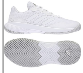
ADIDAS # GW4971 WHITE/GRAY