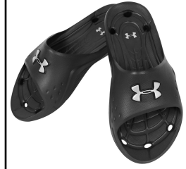
Under Armour # 1287325001 BLACK/WHITE

M Locker: Quick drying one-piece performance molded EVA engineered to transport water away from the foot. (WHOLE SIZE ONLY). Shipping Wt. 32oz, Privil: A/B-1/SHA-1. Sizes: Men's: 7-13 $19.99