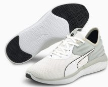
Puma # 19516301 WHITE/GRAY

BETTER FOAM EMERGE 3D: Sockliner made from recycled and sustainably sourced materials. Better Foam midsole made from 35% bio-based sugarcane. Reground and targeted rubber outsole. Sizes: Men's: 8-12,13 $69.99