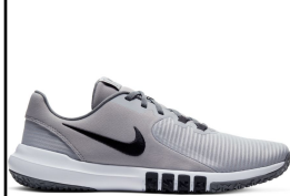
NIKE # CD0197001 GRAY/WHITE/BLACK

FLEX CONTROL 4: Training Shoe. A flexible foam midsole and plush collar keeps you comfortable from box jumps to burpees.