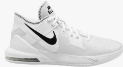
NIKE # CQ9382100 WHITE/BLACK

AIR MAX IMPACT 2: Lightweight mesh upper with reinforced toe. Rubber outsole with herringbone traction. Rubber wraps up forefoot for durability. Foam midsole. Sizes: Men's: 7-12,13,14 $89.99