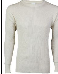
INDERA # I822LSX NATURAL (Extra Heavy)

WAFFLE KNIT: Long John. Extra Heavy. 9.1 oz. Rated for Extreme Cold. Rib Cuffs. 50% Cotton/50% Polyester. Ship. Wt. 18oz. Privil. A/B-2, SHU/PSU-2