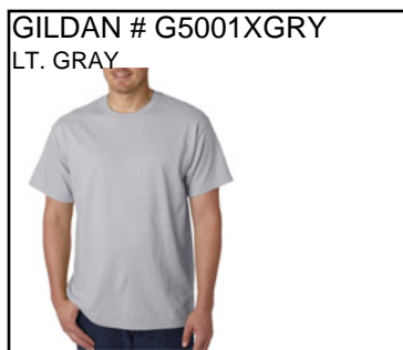
GILDAN # G5001XGRY LT. GRAY

S.S. T-SHIRT: Preshrunk. 100% cotton jersey. 6-oz. double-needle 7/8" collar. Taped neck and shoulders. Double-needle bottom hem. Ship. Wt. 11oz. Privil. A/B-5, SHU/PSU-3