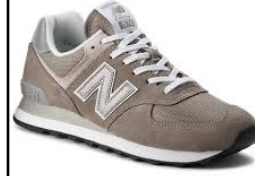
N.B. # ML574EVG LT. GRAY

New Balance aims to become recognized as the world's leading manufacturer of high performance footwear with a commitment to domestic manufacturing. Extensive width-sizing. For special requests such as large sizes and widths, don't hesitate to write. Remember to always list alternatives.