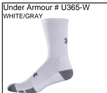
Under Armour # U365-W WHITE/GRAY

CREW SOCK: A soft and supple Spandex blend of nylon, polyester, and Lycra. Designed to conform to the shape of your foot. Priced individually.