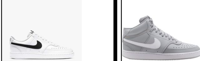
NIKE # CD5466003 GRAY/WHITE

COURT VISION MID: Baby brother to Air Force 1. Stitching at the vamp and panels. Leather upper. Padded tongue and collar. Mesh lining. NO Size 9,9.5,10