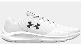
Under Armour # 3024878102 WHITE/BLACK

CHARGED PURSUIT 3: Availability: February 2022