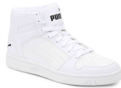
Puma # 36957303 WHITE/BLACK

REBOUND LAYUP HIGH: Mid-cut basketball. Synthetic leather upper combined with a durable cupssole. Ensures a comfortable and supportive fit.