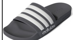
ADIDAS # GY1891 BLACK/WHITE

ADILETTE SHOWER: Availability: February 2022 Whole Sizes Only Sizes: Men's: 7-14 $21.99