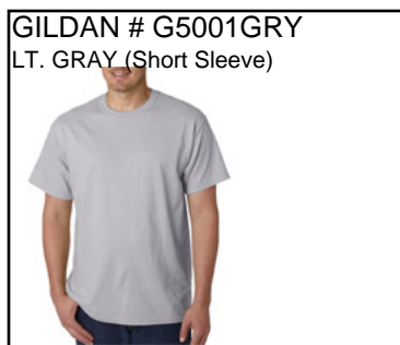
GILDAN # G5001GRY LT. GRAY (Short Sleeve)

S.S. T-SHIRT: Preshrunk. 100% cotton jersey. 6-oz. double-needle 7/8" collar. Taped neck and shoulders. Double-needle bottom hem. Ship. Wt. 11oz. Privil. A/B-5, SHU/PSU-3