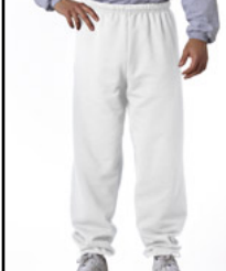
JERZEES # J9732WHT WHITE

SWEAT PANTS: Preshrunk 50% cotton/50% polyester, 8-oz. Spill-resistant fleece. Covered elastic waistband. Elastic bottom leg. No pockets. Ship. Wt. 18oz. Privil. A/B-2, SHU/PSU-2 Sizes: X-Gender: M - XL $15.99