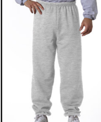
JERZEES # J973XASH ASH

SWEAT PANTS: Preshrunk 50% cotton/50% polyester, 8-oz. Spill-resistant fleece. Covered elastic waistband. Elastic bottom leg. No pockets. Ship. Wt. 18oz. Privil. A/B-2, SHU/PSU-2 Sizes: Men's: 2XL - 3XL $21.99