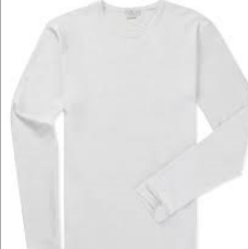
JERZEES # J29LS WHITE

L.S. T-SHIRT: Preshrunk 50% cotton, 50% polyester jersey. 5.6-oz. Seamless body and crew neck. Ribbed cuffs. Shoulder-to-shoulder taping. Double needle bottom hem. Ship. Wt. 13oz. Privil. A/B-5, Sizes: Men's: M - XL $6.99