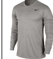
NIKE # 718837063 GRAY