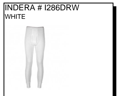
INDERA # I286DRW WHITE

ICETEX: 7.5 oz. 100% HydroPur Inside - 100% Cotton Outside. Heavyweight. Wicks moisture. Added cotton for comfort. Scent blocking. Rib cuffs. Ship. Wt. 18oz. Privil. A/B-2, SHU/PSU-2