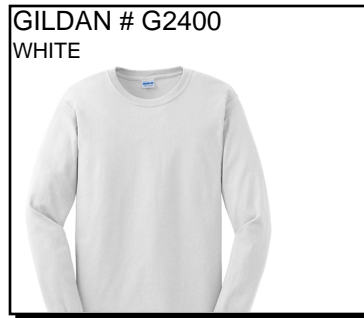
GILDAN # G2400 WHITE

L.S. T-SHIRT: Preshrunk. 100% cotton jersey, 6-oz. double-needle 7/8" collar. Taped neck & shoulders. Rib-knit cuffs. Double-needle bottom hem. Ship. Wt. 13oz. Privil. A/B-5, SHU/PSU-3