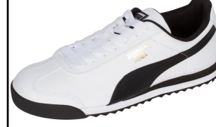
Puma # 370968-01 WHITE/BLACK

ROMA: The original. Debuted in 1968. Geared for sprints and hurdles. Leather upper. Padded tongue. Arch support. Shipping Wt. 32oz, Privil: A/B-1/SHU-1