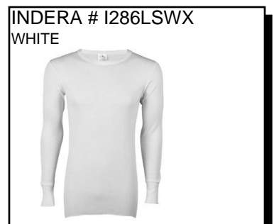
INDERA # I286LSWX WHITE

ICETEX: 100% HydroPur Inside - 100% Cotton Outside. Heavyweight. Wicks moisture. Added cotton for comfort. Scent blocking. Rib cuffs. 8.0 oz Ship. Wt. 18oz. Privil. A/B-2, SHU/PSU-2