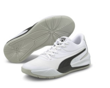
Puma # 19521706 WHITE/BLACK

GRAVITON PRO: Availability: Decemeber 2021