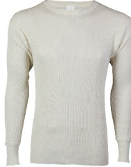
INDERA # I822LS NATURAL (Extra Heavy)

WAFFLE KNIT: Long John. Extra Heavy. 9.1 oz. Rated for Extreme Cold. Rib Cuffs. 50% Cotton/50% Polyester. Ship. Wt. 18oz. Privil. A/B-2, SHU/PSU-2