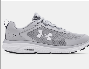
Under Armour # 3024590101 GRAY/WHITE

UA CHR9 PURSUIT 2: Mesh upper is extremely lightweight & breathable. Foam padding placed around your ankle collar & under the tongue for an incredibly comfortable fit & feel. Tire inspired outsole. Sizes: Men's: 7-12,13,14 $62.99