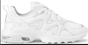
NIKE # AT4404100 WHITE/WHITE

AIR MAX GRAVITON: Trainer. The textured fabric panels of this sports shoe are complemented with leather overlays and the lace up is finished with the famous Swoosh.