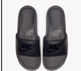
NIKE # 343880001 BLACK

BENASSI JDI: One piece synthetic upper with jersey lining and foam package. Injected phylon midsole/outsole. WHOLE SIZES ONLY.