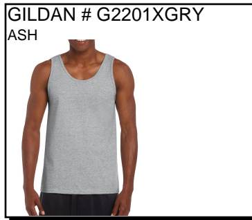
GILDAN # G2201XGRY ASH

TANK TOP: Preshrunk. 100% cotton jersey. 6-oz. Banded neck and armholes. Double-needle bottom hem. Ship. Wt. 10oz. Privil. A/B-5, SHU/PSU-3