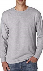
JERZEES # J291LSXGRY LT. GRAY

L.S. T-SHIRT: Preshrunk 50% cotton, 50% polyester. 5.6-oz. Seamless body and crew neck. Ribbed cuffs. Shoulder-to-shoulder taping. Double needle bottom hem. Ship. Wt. 13oz. Privil. A/B-5, Sizes: Men's: 2XL - 3XL $11.49