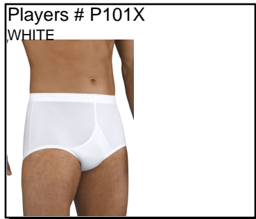
Players # P101X WHITE

COTTON BRIEF: 100% combed cotton material shrink resistant. Machine wash warm. Made in the USA. 2 PCS/PKG.