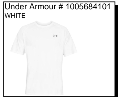
Under Armour # 1005684101 WHITE

TECH T 2.0 SS: 100 % Polyester. Signature Moisture Transport System. Anti-Odor technology. Ship. Wt. 11oz. Privil. A/B-5, SHU/PSU-3