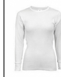
INDERA # I287LSW WHITE

ICETEX - TOP: Thermal Underwear 8.0 oz. 100% HydroPur Inside, 100% Cotton Outside. Heavyweight. Wicks moisture. Added cotton for comfort. Scent blocking. Rib cuffs.