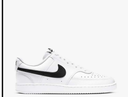
NIKE # CD5463101 WHITE/BLACK

COURT VISION LOW: Retro Hoops 1980's inspiration. Basketball shoes. Vulcanized construction fuses the outsole to midsole for a streamlined look that's durable and comfortable.