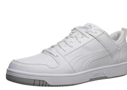
Puma # 36986603 WHITE/GRAY

REBOUND LAYUP LO: Perforated toe. Lace-up closure. Logo detailing along upper Padded collar and tongue Fabric lining with comfort footbed.