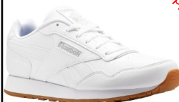
REEBOK # CM9203 WHITE/GUM OUTSOLE

CL HARMAN RUN: Leather upper. Brand logo detail hits throughout. Soft fabric lining and footbed. Textured gum rubber outsole.