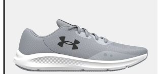
Under Armour # 3044878104 GRAY/WHITE/BLACK

CHARGE PURSUIT 3: Availability: March 2022