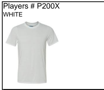
Players # P200X WHITE

COTTON CREW TEE: 100% combed cotton material shrink resistant. Machine wash warm. Made in the USA. 2 PCS/PKG.