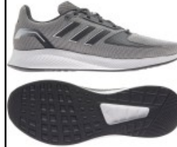
ADIDAS # GV7134 GRAY/WHITE/CHARCOL

RUN FALCON: Availability: December 2021 Sizes: Men's: 7-12,13 $59.99