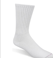
MBS # 273-110 WHITE

CREW: Full cushion cotton foot for extra comfort. Contents: 88% cotton/10% polyester/2% other. Ship. Wt. 5oz. Privil. A/B-7, SHU/PSU-6