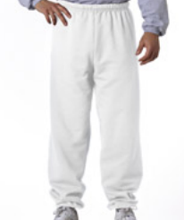
JERZEES # J9732WHTX WHITE

SWEAT PANTS: Preshrunk 50% cotton/50% polyester, 8-oz. Spill-resistant fleece. Covered elastic waistband. Elastic bottom leg. No pockets. Ship. Wt. 18oz. Privil. A/B-2, SHU/PSU-2 Sizes: X-Gender: 2XL - 3XL $18.99