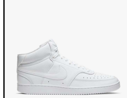
NIKE # CD5466100 WHITE

COURT VISION MID: Baby brother to Air Force 1. Stitching at the vamp and panels. Leather upper. Padded tongue and collar. Mesh lining.