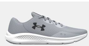
Under Armour # 3024878104 GRAY/BLACK/WHITE

CHARGE PURSUIT: Availability: February 2022