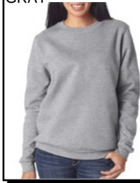
ANVIL # 71000FLGRY GRAY

SWEAT SHIRT: Crew Neck. 75% cotton/25% polyester fleece. 7.2-oz. 1/4" neck tape. Rib-knit with spandex double-needle topstitched neck, shoulders and waistband.