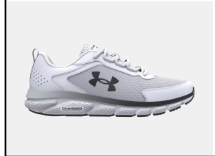
Under Armour # 3024590108 WHITE/BLACK