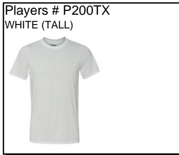
Players # P200TX WHITE (TALL)

COTTON CREW TEE TALL: 100% combed cotton material shrink resistant. Machine wash warm. Made in the USA. 2 PCS/PKG.