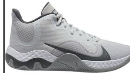
NIKE # CK2669002 GRAY/WHITE

RENEW ELEVATE: Basketball . Agile performance. Textile upper, accented with a TPU Swoosh and fortified with no-sew overlays. Boy's size 3.5-6.5, Women 5.5-8.5