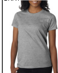
GILDAN # 2000LGRY GRAY

CREW T-SHIRT: 100% preshrunk cotton. 6-oz. Feminine fit. Taped neck&shoulders. Seamless 5/8" neck. Sleeve & bottom hems quarter-turned to eliminate crease.