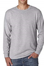
JERZEES # J291LSGRY LT. GRAY

L.S. T-SHIRT: Preshrunk 50% cotton, 50% polyester. 5.6-oz. Seamless body and crew neck. Ribbed cuffs. Shoulder-to-shoulder taping. Double needle bottom hem. Ship. Wt. 13oz. Privil. A/B-5, Sizes: Men's: M-XL $7.99