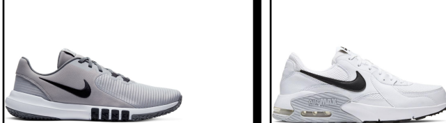
NIKE # CD4165100 WHITE/BLACK/GRAY

AIR MAX EXCEE: Air-Sole is visible in 3 windows for an updated look. Lightweight Comfort. Foam midsole and outsole provide comfort without weighing you down. Mesh, leather and suede upper.