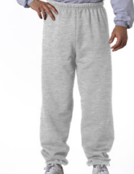
JERZEES # J973ASH ASH

SWEAT PANTS: Preshrunk 50% cotton/50% polyester, 8-oz. Spill-resistant fleece. Covered elastic waistband. Elastic bottom leg. No pockets. Ship. Wt. 18oz. Privil. A/B-2, SHU/PSU-2 Sizes: Men's: M - XL $15.99