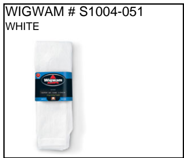
WIGWAM # S1004-051 WHITE

SUPER 60 TUBE: Cotton athletic sock in all over calf length. Welt top. Cushion insole. 3 pair per pack. 85% cotton, 15% stretch nylon.