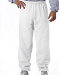
JERZEES # J9732XWHT WHITE

SWEAT PANTS: Preshrunk 50% cotton/50% polyester, 8-oz. Spill-resistant fleece. Covered elastic waistband. Elastic bottom leg. No pockets. Ship. Wt. 18oz. Privil. A/B-2, SHU/PSU-2 Sizes: X-Gender: M - XL $21.99