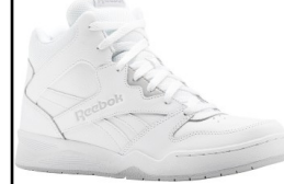
REEBOK # CN4107 WHITE/GRAY

ROYAL BB4500H2: Leather and mesh upper for a blend of support and breathability. Mid-cut design for added stability and support around the ankles. EVA sockliner. Shipping Wt. 32oz. Privil: A/B-1/SHA-1. Sizes: Men's: 7-12,13 $54.99