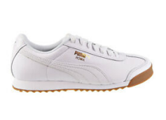
Puma # 36640801 WHITE/GUM

ROMA BASIC: Leather upper with tonal T-toe overlays. EVA midsole for lightweight cushioning. Gum rubber outsole for durable grip and traction.