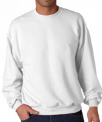
JERZEES # J562WX WHITE

SWEAT SHIRT: Preshrunk 50% cotton/50% polyester. 8-oz. Spill-resistant fleece. Seamless body with set-in sleeves. Double-needle cover-stitched collar. Ship. Wt. 17oz. Privil. A/B-2, SHU/PSU-2 Sizes: X-Gender: 2XL - 4XL $14.99