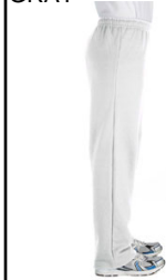
GILDAN # 18400FLXGRY GRAY

SWEAT PANTS: Preshrunk 50% cotton/50% polyester. 8-oz. soft feel and no pilling. No Pockets. Differential rise for better fit. Slightly tapered leg with open bottom.