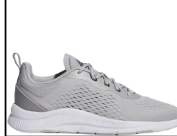
ADIDAS # FW7300 GRAY/WHITE

NOVAMOTION: Workout sneaker. Plush cushioning brings comfort to each step. Breathable mesh upper. Cloudfoam midsole and OrthoLite sockliner. Rubber outsole.