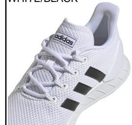
ADIDAS # GZ6544 WHITE/BLACK

KAPTIR: Availability: November 2021 Sizes: Men's: 7-12,13 $81.99