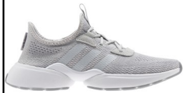
ADIDAS # FW4593 GRAY/WHITE

MAVIA X: Light weight running. Mesh Upper. Anatomical sockliner. Three stripe branding. Adiwear rubber outsole.