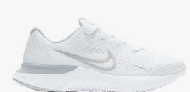
NIKE # CU3505100 WHITE/GRAY

RENEW RUN 2: Casual runs and all-day wear. Midsole has higher foam heights for a softer feel. Open-hole mesh on the upper for lightweight breathability.