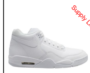
NIKE # BQ4212101 WHITE

FLIGHT LEGACY: A durable, rubber outsole has a classic '80s BB look. An Air unit provides responsive cushioning. Light - weight midsole has a plush, cushioned feel. Tumbled leather. Supply Limited