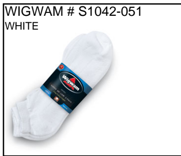
WIGWAM # S1042-051 WHITE

SUPER 60 LOW: Cotton athletic sock in low cut length. Welt top. Cushion sole. 3 pair per pack. 86% cotton, 14% stretch nylon.