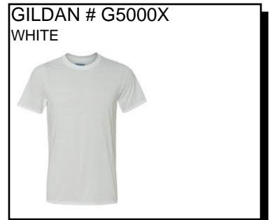
GILDAN # G5000X WHITE

S.S. T-SHIRT: Preshrunk. 100% cotton jersey. 6-oz. double-needle 7/8" collar. Taped neck and shoulders. Double-needle bottom hem. Ship. Wt. 11oz. Privil. A/B-5, SHU/PSU-3