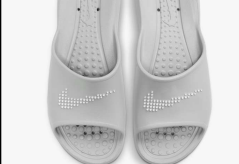
NIKE # CZ5478002 GRAY

VICTORI ONE : Contoured foam adds total comfort, while iconic Nike branding gives these sandals a dash of heritage athletic style. Vented for water to go thru the shoe.