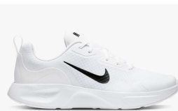
NIKE # CJ1677100 WHITE/BLACK

WEAR ALL DAY: Featuring no-sew skins along the airy mesh for lasting usage. Attractive embroidered logo, responsive injection phylon foam and traction-improving waffle tread rubber sole. Sizes: Women's: 5-10,11 $64.99