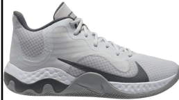
NIKE # B-CK2669002 GREY/WHITE/CHARCOL

RENEW ELEVATE: Basketball . Agile performance. Textile is executed on the upper, accented with a TPU Swoosh and fortified with no-sew overlays. Boys 3.5-7, Women 5.5-9 Sizes: X-Gender: See Above $79.99