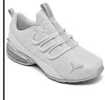
Puma # 37602101 WHITE/SILVER