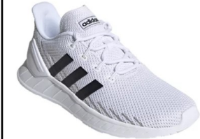
ADIDAS # FY9560 WHITE/BLACK

QUESTAR FLOW: Breathable knit upper with padded collar and textile lining. Lightweight Cloudfoam midsole and outsole. Molded heel counter. Three stripes branding detail. Ship. Wt. 11oz. Priv. A/B-5 Sizes: Men's: 7-12,1,,14 $72.99