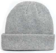
MBS # Y1501GRY GRAY

BEANIE CAP: Keep a warm head with this sturdy knit cap. 100% hypoallergenic acrylic cuffed cap. Ship. Wt. 3oz. Privil. A/B-3, SHU/PSU-1