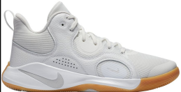
NIKE # CU3503100 WHITE/GRAY/GUM

FLY BY MID: Basketball provides cushioning, support and traction for the game's constant multidirectional movements. Premium padded collar.