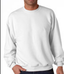
JERZEES # J562WHT WHITE

SWEAT SHIRT: Preshrunk 50% cotton/50% polyester. 8-oz. Spill-resistant fleece. Seamless body with set-in sleeves. Double-needle cover-stitched collar. Sizes: X-Gender: M - XL $10.99