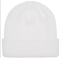
MBS # Y1501WHT WHITE

YUPOONG CAP: Keep a warm head with this sturdy knit cap. 100% hypoallergenic acrylic cuffed cap. Ship. Wt. 3oz. Privil. A/B-3, SHU/PSU-1