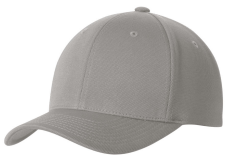
MBS # Y1503GRY GRAY

BASEBALL HAT: Curved brim. Adjustable velcro strap for a proper fit. Ship. Wt. 3oz. Privil. A/B-3, SHU/PSU-0