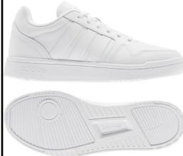
ADIDAS # H00464 WHITE

POST MOVE: Coated polyurethane leather upper. Stripes branding. Cludfoam Super cushioning on a pillowy-soft midsole. Padded collar. Three-quarter rubber cupssole.