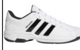
ADIDAS # FX4981 WHITE/BLACK

PRO MODEL 2G: Shell toe design with bounce midsole. Flexible cushioning delivers springy responsiveness. Leather and synthetic uppers. Rubber outsole.