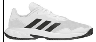
ADIDAS # GW2984 WHITE/BLACK

COURT JAM CONTROL: Availability: September 2022