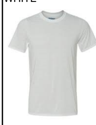
Players # P200X WHITE

COTTON CREW TEE: 100% combed cotton material shrink resistant. Machine wash warm. Made in the USA. 2 PCS/PKG.