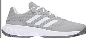
ADIDAS # GW2992 GRAY/WHITE

GAME COURT 2: Availability: September 2022