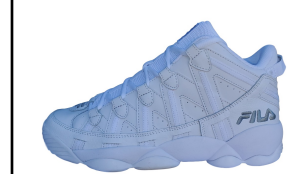
FILA # 1BM01252103 WHITE/GRAY

Fila established in 1911 is an authentic sports brand with superior lifestyle appeal, bringing style, passion and creativity for all it's consumers.