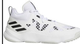
ADIDAS # GW0147 WHITE/BLACK

PRO N3NT 2021: Availability: September 2022