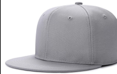
MBS # Y1502GRY GRAY

FLAT BRIM CAP: 6 panel structured cap. 100% Acrylic. Pro style high profile. Rounded flat bill shape. Adjustable snap for a proper fit. Ship. Wt. 3oz. Privil. A/B-3, SHU/PSU-1.