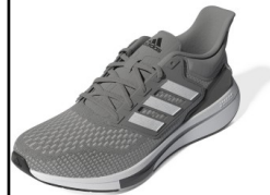
ADIDAS # GW6723 GRAY/WHITE/BLACK

EQ21 RUN: Running sneaker. A breathable upper keeps feet feeling cool. Lightweight cushioning. This product is made with recycled content as part of our ambition to end plastic waste. Sizes: Men's: 7-12,13,14 $78.99