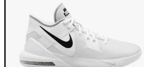
NIKE # CQ9382100 WHITE/BLACK

AIR MAX IMPACT 2: Lightweight mesh upper with reinforced toe. Rubber outsole with herringbone traction. Rubber wraps up forefoot for durability. Foam midsole.