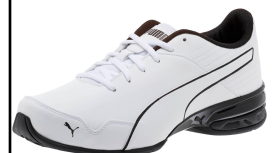
Puma # 19097401 WHITE/BLACK

A success story is about more than just being at the right place at the right time. To play in the major league, you need an understanding for the philosophy of sports. You need to be Forever Faster. From its beginnings as a shoe factory for football boots to the supplier of successful athletes we are today, PUMA has proven time and time again how its innovations helped athletes to perform at their best.