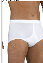
Players # P101X WHITE

COTTON BRIEF: 100% combed cotton material shrink resistant. Machine wash warm. Made in the USA. 2 PCS/PKG.