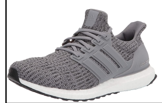
ADIDAS # FY9319 GRAY/WHITE/BLACK

ULTRABOOST 4.0 DNA: Sock-like fit. Adidas Primeknit upper. Midfoot cage and supportive heel counter. Boost midsole. Rubber outsole.