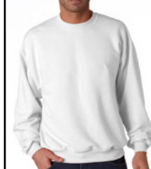
JERZEES # J562WX WHITE

SWEAT SHIRT: Preshrunk 50% cotton/50% polyester. 8-oz. Spill-resistant fleece. Seamless body with set-in sleeves. Double-needle cover-stitched collar. Sizes: X-Gender: 2XL - 4XL $16.99