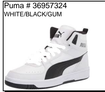
REBOUND LAYUP MID:

M LOCKER: One-piece performance molded EVA engineered to transport water away from the foot. (WHOLE SIZE ONLY). Sizes: Men's: 7-13,14,15 $19.99