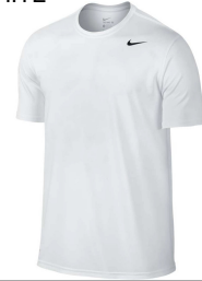
CLOTHING # 718833100 WHITE

SHORT SLEEVE T'S: Dri-FIT. Short-sleeve construction is ideal for a variety of training conditions. Neck tape added for durability and comfort. Ship. Wt. 3oz. Privil. A/B-3, SHU/PSU-1.