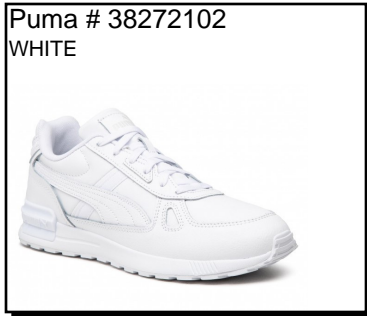
GRAVITON PRO L: