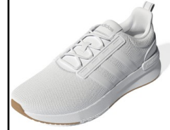
ADIDAS # GX4208 WHITE/GUM

RACER TR21: Textile upper. Soft feel running style. Cloudfoam midsole. Textile lining. Rubber outsole. Primegreen-50% of the upper is recycled content.