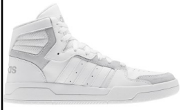
ADIDAS # FW3457 WHITE/WHITE SUEDE

ENTRAP MID: Leather & Suede Upper. Soft lining. A basketball-like design. Rubber outsole. A retro character, and modern cushioning. NO Size 9.