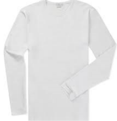
JERZEES # J29LS WHITE

L.S. T-SHIRT: Preshrunk 50% cotton, 50% polyester jersey. 5.6-oz. Seamless body and crew neck. Ribbed cuffs. Shoulder-to-shoulder taping. Double needle bottom hem. Ship. Wt. 13oz. Privil. A/B-5, SHU/PSU-2 Sizes: Men's: M - XL $7.99