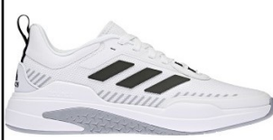
ADIDAS # GX0733 WHITE/BLACK/GRAY

TRAINER V: Flexible knit upper with stretch. Snug feel. Bounce midsole. Rubber outsole. Upper contains a minimum of 50% recycled content.