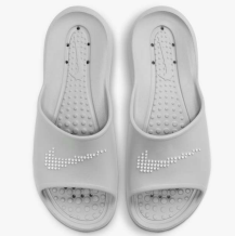
NIKE # CZ5478002 GRAY

VICTORI ONE: Contoured foam for comfort, while iconic Nike branding gives these sandals a dash of heritage athletic style. Vented for water to go thru the shoe. Whole Sizes Only.