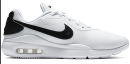
NIKE # CJ1672100 WHITE/BLACK

AIR MAX OKETO: A minimal aesthetic and the comfortable cushioning of a Max Air unit. Its clean and simple mesh upper is elevated by subtle design details.