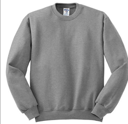
JERZEES # J562GRY LT. GRAY

SWEAT SHIRT: Preshrunk 50% cotton/50% polyester. 8-oz. Spill-resistant fleece. Seamless body with set-in sleeves. Double-needle cover-stitched collar. Ship. Wt. 17oz. Privil. A/B-2, SHU/PSU-2 Sizes: Men's: M - XL $14.99