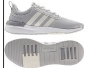
ADIDAS # GZ8194 GRAY/WHITE

RACER TR21: A cushioned Cloudform midsole for an all-day soft step. Made from high-performance recycled materials.