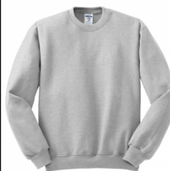
JERZEES # J5621XASH ASH

SWEAT SHIRT: Preshrunk 50% cotton/50% polyester. 8-oz. Spill-resistant fleece. Seamless body with set-in sleeves. Double-needle cover-stitched collar. Ship. Wt. 17oz. Privil. A/B-2, SHU/PSU-2 Sizes: Men's: 2XL - 4XL $19.99