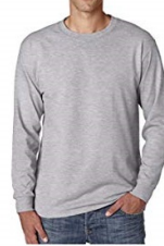
JERZEES # J291LSGRY LT. GRAY

L.S. T-SHIRT: Preshrunk 50/50 cotton/polyester. 5.6-oz. Seamless body and crew neck. Ribbed cuffs. Shoulder-to-shoulder taping. Double needle bottom hem. Ship. Wt. 13oz. Privil. A/B-5, SHU/PSU-3 Sizes: Men's: M-XL $10.99