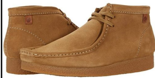
CLARKS # 26159438 SAND SUEDE

One of the largest and oldest shoe companies in the world. Established in 1825, they are committed to comfort, quality and authenticity. At Clarks, we design shoes with our customers in mind. People who wear Clarks are adventurous, exciting and spontaneous. They forge their own path. We welcome special orders for larger sizes.