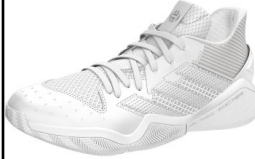
ADIDAS # FW8488 WHITE/GRAY

HARDEN STEPBACK: MVP James Harden. Lightweight and flexible. Durable and comfortable. A signature Harden logo on the tongue. NO Size 9, 10, 12, 13