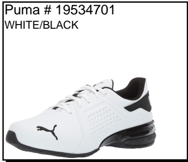
VIZ RUNNER SPORT: