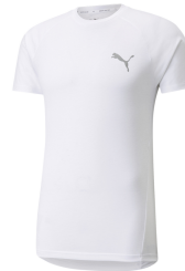
Puma # 52031402 WHITE

PERFORMANCE T's: 100 % Polyester. Signature Moisture Transport System. Anti-Odor technology. Ship. Wt. 11oz. Privil. A/B-5, SHU/PSU-3