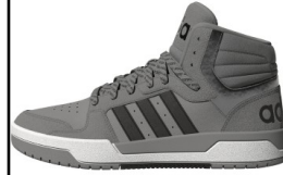
ADIDAS # GX3142 GRAY/WHITE/CHARCOL

ENTRAP MID: Supply limited. List alternatives. Leather upper. Textile tongue and collar. Padded ankle. Textile lining. Rubber outsole.