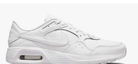
NIKE # DH9636101 WHITE