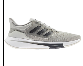
ADIDAS # H68075 LT. GRAY/WHITE/BLACK

EQ21 RUN: Breathable upper that keeps your foot cool. TPU quarter and heel stabilizers to ensure firm stride. Rubber sole.