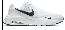
NIKE # CJ1670102 WHITE/BLACK

AIR MAX FUSION: Mesh, leather and suede upper with synthetic leather overlays. Cushioned insole. Foam midsole and foam outsole. Rubber outsole.