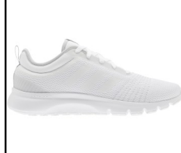
ADIDAS # H01995 WHITE

FLUIDUP: Knitted, breathable upper. Flexible Bounce midsole. Cloud Foam midsole for added comfort. Patterned rubber outsole. Ship. Wt. 11oz. Privil. A/B-5, SHU/PSU-3