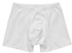
Players # P450X WHITE

BOXER: 50% cotton and 45% polyester. Shrink resistant, machine wash warm. Made in the USA. 2 PCS/PKG.