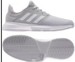
ADIDAS # GZ8516 GRAY/WHITE

GAME COURT: Primegreen upper is made with a series of high-performance recycled materials. Cushioned Cloudfoam midsole offers enhanced take-off and landing