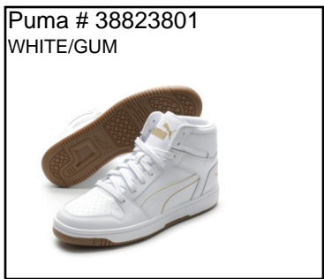
REBOUND LAYUP LUX: