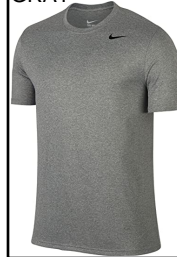
CLOTHING # 718833063 GRAY

SHORT SLEEVE T'S: Dri-FIT. Short-sleeve construction is ideal for a variety of training conditions. Neck tape added for durability and comfort. Ship. Wt. 3oz. Privil. A/B-3, SHU/PSU-1.