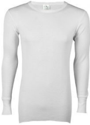
INDERA # I286LSWX WHITE

ICETEX: 100% HydroPur Inside - 100% Cotton Outside. Heavyweight. Wicks moisture. Added cotton for comfort. Scent blocking. Rib cuffs. 8.0 oz Ship. Wt. 18oz. Privil. A/B-2, SHU/PSU-2 Sizes: Men's: 2XL - 3XL $16.99