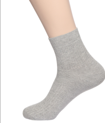
MBS # 925-102 GRAY

ANKLE: Full cushion cotton foot for extra comfort. Contents: 88% cotton/10% polyester/2% other. Ship Wt. 32oz, Privil: A/B-1/SHU-1