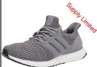
ADIDAS # FY9319 GRAY/WHITE/BLACK OUTSOLE