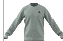
ADIDAS # H12221 GRAY/BLACK

ESSENTIAL SWEATSHIRT: A regular fit. Adidas logo. Athletic look. Crewneck. Long Sleeve. Regular fit.