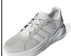
ADIDAS # GX4691 WHITE/GRAY

OZELLE: Running. The thick design lines and sturdy outsole are well-matched by the soft Cloudfoam midsole, which adds springiness to your run.