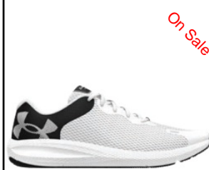
Under Armour # 3024138103 WHITE/BLACK

UA CHR9 PURSUIT: Mesh upper, lightweight & breathable. Foam padding around the ankle collar & under the tongue for an incredibly comfortable fit & feel.