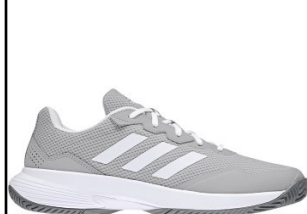
ADIDAS # GW2992 GRAY/WHITE

GAME COURT 2: Breathable, flexible mesh upper. Cushioned EVA foam midsole Extra padding in heel. Durability & Traction. Adiwear outsole offers the ultimate high-wear