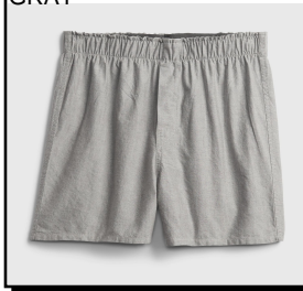
MBS # MB234GRY GRAY

BOXER: 3 PPK. Cotton/Polyester bland. Relax fit. Fly front. No bunching. Soft, flexible waist band. Sizes: Men's: S - XL $14.99