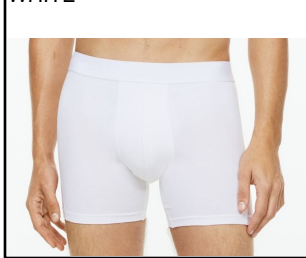
MBS # MBB123WHTX WHITE

BOXER BRIEF: 3 PPK. Comfort flex waistband. Cotton bland. Breathable and Soft. Wide waist band. Functional fly.