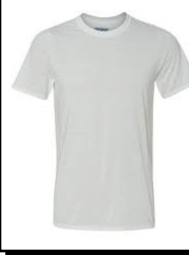
MBS # G5000 WHITE

S.S. T-SHIRT: Preshrunk. 100% cotton jersey. 6-oz. double-needle 7/8" collar. Taped neck and shoulders. Double-needle bottom hem. Ship Wt. 32oz, Privil: A/B-1/SHU-1 Sizes: Men's: S - XL $4.99