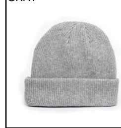
MBS # Y1501GRY GRAY

BEANIE CAP: Keep a warm head with this sturdy knit cap. 100% hypoallergenic acrylic cuffed cap. Ship. Wt. 3oz. Privil. A/B-3, SHU/PSU-1