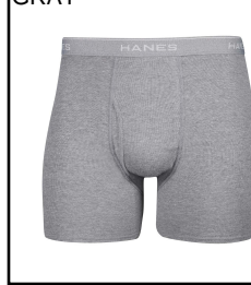
MBS # MBB123GRYX GRAY

BOXER BRIEF: 3 PPK. Comfort flex waistband. Cotton bland. Breathable and Soft. Wide waist band. Functional fly.