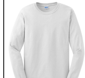
MBS # G2400X WHITE

L.S. T-SHIRT: Preshrunk. 100% cotton jersey, 6-oz. double-needle 7/8" collar. Taped neck & shoulders. Rib-knit cuffs. Double-needle bottom hem. Ship Wt. 32oz, Privil: A/B-1/SHU-1 Sizes: Men's: 2XL-5XL $14.99