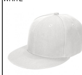
MBS # Y1502WHT WHITE

FLAT BRIM CAP: 6 panel structured cap. 100% Acrylic. Pro style high profile. Rounded flat bill shape. Adjustable snap for a proper fit. Ship. Wt. 4oz. Privil. A/B-3, SHU/PSU-0