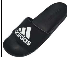
ADIDAS # CG3425 BLACK/WHITE

ADILETTE: Synthetic upper w/ Adidas Badge. Textile lining for comfort. Contoured cloudfoam. (WHOLE SIZES ONLY). We May Sub. GZ3779 or GZ3774.