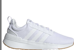
ADIDAS # GX4208 WHITE/GUM

RACER TR21: Textile upper. Soft feel running style. Cloudfoam midsole. Textile lining. Rubber outsole. Primegreen-50% of the upper is recycled content.