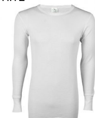
INDERA # I286LSWX WHITE

ICETEX: 7.5 oz. 100% HydroPur Inside, 100% Cotton Outside. Heavyweight. Wicks moisture. Added cotton for comfort. Scent blocking. Rib cuffs.