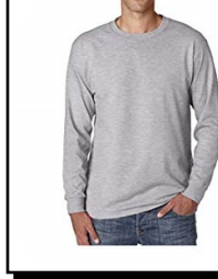
MBS # J291LSXGRY LT. GRAY

L.S. T-SHIRT: Preshrunk 50% cotton, 50% polyester. 5.6-oz. Seamless body and crew neck. Ribbed cuffs. Shoulder-to-shoulder taping. Double needle bottom hem. Ship. Wt. 13oz. Privil. A/B-5, SHU/PSU-3 Sizes: Men's: 2XL - 3XL $18.99