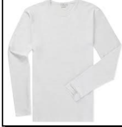
MBS # J29LS WHITE

L.S. T-SHIRT: Preshrunk 50% cotton, 50% polyester jersey. 5.6-oz. Seamless body and crew neck. Ribbed cuffs. Shoulder-to-shoulder taping. Double needle bottom hem. Ship Wt. 32oz, Privil: A/B-1/SHU-1 Sizes: Men's: M - XL $7.99