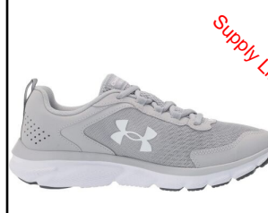
Under Armour # 3024590101 GRAY/WHITE

ASSERT: Lightweight mesh upper with 3-color digital print delivers complete breathability. Leather overlays. EVA sockliner provides soft, step-in comfort. SIZE 9,5,13,14,15 Only!