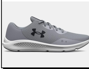
Under Armour # 3024878104 GRAY/BLACK/WHITE

CHARGE PURSUIT: Mesh upper for lightweight breathability. Foam padding around your ankle collar & under the tongue for an incredibly comfortable fit & feel.