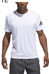
ADIDAS # DU1435 WHITE

FL SPR XZ UL: A regular fit. Adidas logo. Athletic look. Crewneck. Short sleeve. Regular fit. We may sub: GT5558. Washable. Ship. Wt. 11oz. Privil. A/B-5, SHU/PSU-3