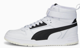
Puma # 38583901 WHITE/BLACK/GUM

RBD GAME: Strapless basketball sneaker. Synthetic leather upper combined with a mid cut padded collar and tongue. Rubber outsole.