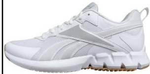
REEBOK # HQ1509 WHITE/GRAY/GUM

ZTAUR RUN: Running. Step-in comfort. Mesh upper keeps your feet ventilated, and the rubber outsole ensures a solid grip with every step. Rubber outsole