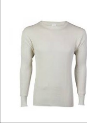
INDERA # I839LSGRY GRAY

LONG JOHN TOP: 6.5 oz - 100% Cotton Waffle. Heavyweight Thermals. Rated for very cold temperatures. Rib cuffs and Tagless.