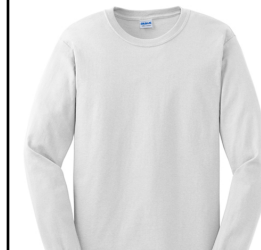
MBS # G2400 WHITE

L.S. T-SHIRT: Preshrunk. 100% cotton jersey, 6-oz. double-needle 7/8" collar. Taped neck & shoulders. Rib-knit cuffs. Double-needle bottom hem. Ship Wt. 32oz, Privil: A/B-1/SHU-1 Sizes: Men's: M - XL $7.99