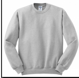
MBS # J562ASH ASH

SWEAT SHIRT: Preshrunk 50% cotton/50% polyester. 8-oz. Spill-resistant fleece. Seamless body with set-in sleeves. Double-needle cover-stitched collar. Ship. Wt. 17oz. Privil. A/B-2, SHU/PSU-2 Sizes: Men's: M - XL $14.99