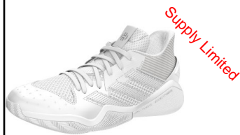
ADIDAS # FW8488 WHITE/GRAY