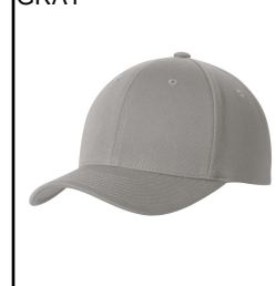
MBS # Y1503GRY GRAY

BASEBALL HAT: Curved brim. Adjustable velcro strap for a proper fit. Ship. Wt. 3oz. Privil. A/B-3, SHU/PSU-0