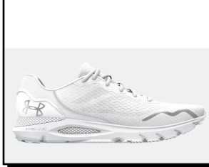
Under Armour # 3026121100 WHITE/GRAY

HOVR SONIC: Breathable, lightweight engineered mesh upper. Deluxe foam sockliner molds to your foot. Responsive UA HOVR cushioning. Durable rubber outsole.