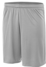
A4 # N5281 LT. GRAY

SHORTS: 100% Polyester Flat. 5-oz. 9 inch. Moisture Wicking. Odor Resistant. Stain Release. 1" waistband. No pockets. Ship. Wt. 11oz. Privil. A/B-2, SHU/PSU-2