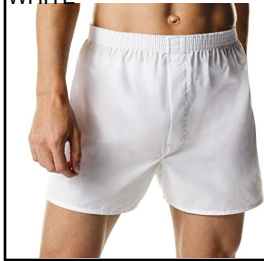
MBS # MB234WHTX WHITE

BOXER: 3 PPK. Cotton/Polyester bland. Relax fit. Fly front. No bunching. Soft, flexible waist band.