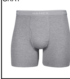
MBS # MBB123GRY GRAY

BOXER BRIEF: 3 PPK. Comfort flex waistband. Cotton bland. Breathable and Soft. Wide waist band. Functional fly.