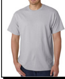
MBS # G5001GRY LT. GRAY (Short Sleeve)

S.S. T-SHIRT: Preshrunk. 100% cotton jersey. 6-oz. double-needle 7/8" collar. Taped neck and shoulders. Double-needle bottom hem. Ship. Wt. 11oz. Privil. A/B-5, SHU/PSU-3 Sizes: Men's: M, L, XL $4.99