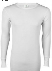
INDERA # I286LSW WHITE

ICETEX: 7.5 oz. 100% HydroPur Inside, 100% Cotton Outside. Heavyweight. Wicks moisture. Added cotton for comfort. Scent blocking. Rib cuffs.