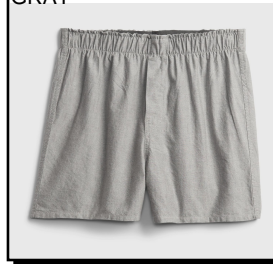
MBS # MB234GRYX GRAY

BOXER: 3 PPK. Cotton/Polyester bland. Relax fit. Fly front. No bunching. Soft, flexible waist band. Sizes: Men's: 2X - 3X $18.99