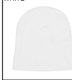
MBS # Y1500WHT WHITE

YUPOONG CAP: Keep a warm head with this sturdy knit cap. 100% hypoallergenic acrylic. Approx. 8 1/2" long. Ship. Wt. 3oz. Privil. A/B-3, SHU/PSU-1