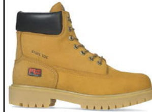
TIMBERLAND # 65030 WHEAT NUBUCK

6" WP BOOT: Waterproof. Direct attached seam sealed. Insulated. EH. Oil Resistant. Padded collar. Shock diffusion plate. NOTE: PRICE exceeds DOC specification.