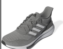
ADIDAS # GW6723 GRAY/WHITE/BLACK

EQ21 RUN: Running sneaker. A breathable upper keeps feet feeling cool. Lightweight cushioning. Made with recycled content.