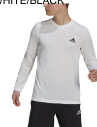
ADIDAS # GT5566 WHITE/BLACK

D2M FEELREADY LONG SLEEVE: A regular fit long sleeve T-Shirt. Adidas logo. Crew Neck. Ship. Wt. 11oz. Privil. A/B-5, SHU/PSU-3