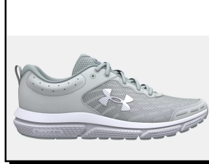
Under Armour # 3026175102 GRAY/WHITE