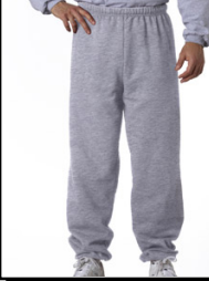
MBS # J9731XGRY LT. GRAY

SWEAT PANTS: Preshrunk 50% cotton/50% polyester, 8-oz. Spill-resistant fleece. Covered elastic waistband. Elastic bottom leg. No pockets. Ship. Wt. 18oz. Privil. A/B-2, SHU/PSU-2 Sizes: Men's: 2XL - 3XL $24.99