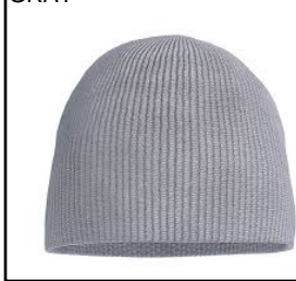
MBS # Y1500GRY GRAY

YUPOONG CAP: Keep a warm head with this sturdy knit cap. 100% hypoallergenic acrylic. Approx. 8 1/2" long. Ship. Wt. 3oz. Privil. A/B-3, SHU/PSU-1