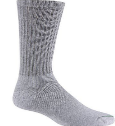
MBS # 872-102 GRAY

CREW: Full cushion cotton foot for extra comfort. Contents: 88% cotton/10% polyester/2% other. Ship. Wt. 5oz. Privil. A/B-7, SHU/PSU-6