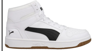
Puma # 36957324 WHITE/BLACK/GUM

REBOUND LAYUP MID: leather & synthetic upper. high-top Basketball. Overlay accents and the signature PUMA branding. Cushioned insole. Rubber outsole.