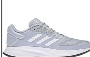
ADIDAS # GW8344 GRAY/WHITE

DURAMO 10: Running shoes. Full-length Lightmotion midsole delivers responsive cushioning. Mesh upper offers elevated comfort from the first step to the last.