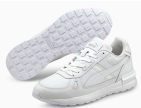
Puma # 38272102 WHITE

GRAVITON PRO L: Synthetic upper multi purpose sneaker. None marking rubber outsole.