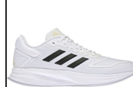
ADIDAS # GW8348 WHITE/BLACK

DURAMO 10: Regular fit. Supportive no-sew overlays. Soft heel. Lightweight cushioning. Rubber outsole. Upper contains a minimum of 50% recycled content.