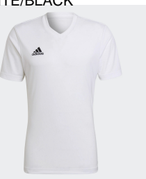
ADIDAS # HC5071 WHITE/BLACK

ENTRADA 22 V-NECK: A regular fit. Adidas logo. Athletic look. Crewneck. Short sleeve. Regular fit.