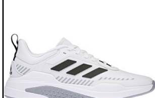
ADIDAS # GX0733 WHITE/BLACK/GRAY

TRAINER V: Flexible knit upper with stretch. Snug feel. Bounce midsole. Rubber outsole. Upper contains a minimum of 50% recycled content.