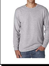
MBS # J291LSGRY LT. GRAY

L.S. T-SHIRT: Preshrunk 50/50 cotton/polyester. 5.6-oz. Seamless body and crew neck. Ribbed cuffs. Shoulder-to-shoulder taping. Double needle bottom hem. Ship. Wt. 13oz. Privil. A/B-5, SHU/PSU-3 Sizes: Men's: M-XL $10.99