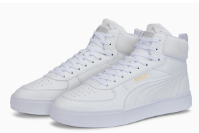
Puma # 38584301 WHITE/GRAY/GUM

CAVEN MID: Leather & syntehtic upper. Round toe. Lace-up vamp. Logo detail. Textile lining. Rubber outsole.