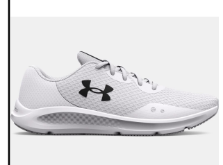
Under Armour # 3024878102 WHITE/BLACK

CHARGED PURSUIT: Mesh upper for lightweight breathability. Foam padding around your ankle collar & under the tongue for an incredibly comfortable fit & feel.