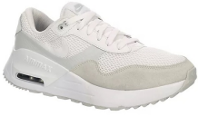
NIKE # DM9537101 WHITE

AIR MAX SYSTEM: Air Max Attitude! Performance running. Mixed material upper delivers durability and breathability while a rubber outsole adds traction that lasts.