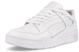
Puma # 38754402 WHITE