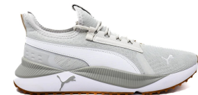
Puma # 38823601 GRAY/WHITE/GUM

PACER FUTURE: Lightweight EVA material for a lifted rubber heel for swift and sturdy stepping. Knit fabric upper. Rubber outsole.