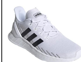
ADIDAS # FY9560 WHITE/BLACK

QUESTAR FLOW: Breathable knit upper with padded collar and textile lining. Lightweight Cloudfoam midsole and outsole. Molded heel counter.