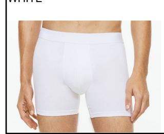
MBS # MBB123WHT WHITE

BOXER BRIEF: 3 PPK. Comfort flex waistband. Cotton bland. Breathable and Soft. Wide waist band. Functional fly.