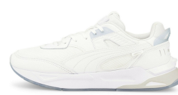
Puma # 39117302 WHITE/CLEAR ICE