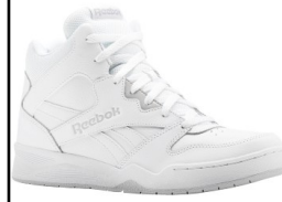
REEBOK # CN4107 WHITE/GRAY ( D,4E )

ROYAL BB4500H2: Leather and mesh upper for a blend of support and breathability. Mid-cut design for added stability and support around the ankles.