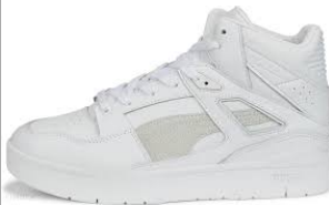
Puma # 38864002 WHITE