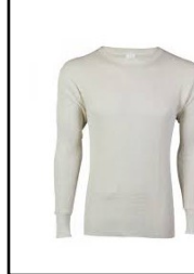
INDERA # I839LSXGRY GRAY

LONG JOHN TOP: 6.5 oz - 100% Cotton Waffle. Heavyweight Thermals. Rated for very cold temperatures. Rib cuffs and Tagless.