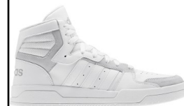
ADIDAS # FW3457 WHITE/SUEDE