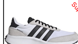
ADIDAS # GY3884 WHITE/BLACK/GRAY

RUN 70's: EVA midsole and a sturdy rubber outsole. Comfortable, responsive walking. Ortholite insole keeps your feet dry.