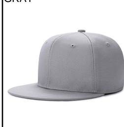
MBS # Y1502GRY GRAY

FLAT BRIM CAP: 6 panel structured cap. 100% Acrylic. Pro style high profile. Rounded flat bill shape. Adjustable snap for a proper fit. Ship. Wt. 3oz. Privil. A/B-3, SHU/PSU-1.