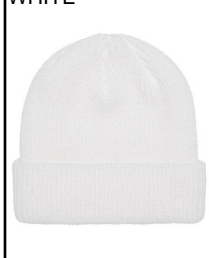
MBS # Y1501WHT WHITE

BENIE CAP: Keep a warm head with this sturdy knit cap. 100% hypoallergenic acrylic cuffed cap.