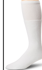
MBS # 823-110 WHITE

TUBE: 85% cotton, 15% Nylon. Full cushion construction. Fits shoe size 6-15. Ship Wt. 32oz, Privil: A/B-1/SHU-1