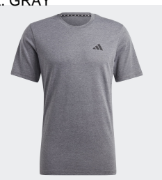
ADIDAS # FL8556 Lt. GRAY

FEELREADY TEE: A regular fit. Adidas logo. Athletic look. Crewneck. Short sleeve. Regular fit. We may sub: GM2076. Washable. Ship. Wt. 11oz. Privil. A/B-5, SHU/PSU-3