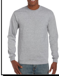
MBS # G2401XGRY LT. GRAY

L.S. T-SHIRT: Long Sleeve. Preshrunk 100% cotton jersey, 6-oz. double-needle 7/8" collar. Taped neck and shoulders. Rib-knit cuffs. Ship. Wt. 13oz. Privil. A/B-5, SHU/PSU-3 Sizes: Men's: 2XL - 5XL $18.99