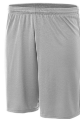
A4 # N5281X LT. GRAY

SHORTS: 100% Polyester Flat. 5-oz. 9 inch. Moisture Wicking. Odor Resistant. Stain Release. 1" waistband. No pockets. Ship. Wt. 11oz. Privil. A/B-2, SHU/PSU-2