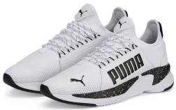
Puma # 37695702 WHITE/BLACK

SOFTTRIDE PREMIUM: Running. Slip-on features a breathable mesh upper w/ adjustable laces to fit your comfort needs. SoftFoam cushioning. Rubber outsole.