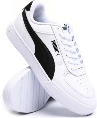
Puma # 38081002 WHITE/BLACK

CAVEN: Synthetic leather upper. Rubber Midsole and Outsole. Perforated toe box. PUMA Logo at tongue and heel.