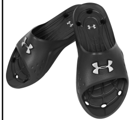
Under Armour # 1287325001 BLACK/WHITE

M LOCKER: One-piece performance molded EVA engineered to transport water away from the foot. (WHOLE SIZE ONLY).