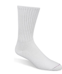
MBS # 273-110 WHITE

CREW: Full cushion cotton foot for extra comfort. Contents: 88% cotton/10% polyester/2% other. Ship Wt. 32oz, Privil: A/B-1/SHU-1