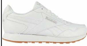
REEBOK # CM9203 WHITE/GUM

CL HARMAN RUN: Leather upper. Brand logo detail hits throughout. Soft fabric lining and footbed. Textured gum rubber outsole.