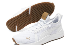
Puma # 39436101 WHITE/GUM/TAN NUBUCK