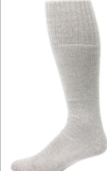
MBS # 656-102 GRAY

TUBE: 85% cotton, 15% Nylon. Full cushion construction. Fits shoe size 6-15. Ship. Wt. 5oz. Privil. A/B-7, SHU/PSU-6