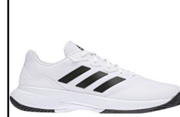
ADIDAS # GW2991 WHITE/BLACK

GAME COURT 2: Lightweight mesh upper and padded heels. Full-length EVA midsole provides a stable and comfortable fit. Durable outsole for traction. EVA midsole.