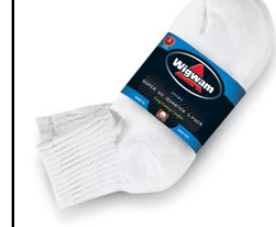
WIGWAM # S1158-051 WHITE

SUPER 60 QTR: Cotton athletic sock in quarter length. Welt top. Cushion sole. 3 pair per pack. 85% cotton, 15% stretch nylon.