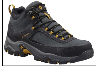
COLUMBIA # 1723842089 GRAY/YELLOW

GRANITE RIDGE MID WP: Waterproof suede and textile upper. Fully lined. Techlite light weight midsole. Midsole ports for ventilation. Non marking rubber outsole. Sizes: Men's: 7-12,13,14,15 $69.99