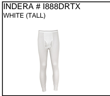
INDERA # I888DRTX WHITE (TALL)

LONG JOHN TALL BOTTOM: 9.1 oz. Rated for Extreme Cold. Rib Cuffs. 50% Cotton/50% Polyester. Ship. Wt. 18oz. Privil. A/B-2, SHU/PSU-2