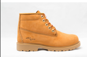
MIKE'S # 1068-100 TAN NUBUCK

5" BOOT WP: Full Grain Leather upper. Solid, light weight n flexible. Oil and abrasion resistant. Padded collar. Fully lined. Cushion insole. Waterproof.