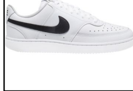
NIKE # CD5463101 WHITE/BLACK

COURT VISION LOW: Go for that retro look. Featuring leather upper. Fully lined. Padded collar and tongue. Perforated toe box. LIST ALTERNATIVES!!