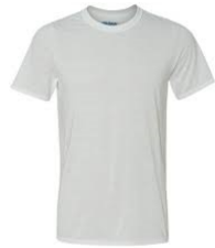
Players # P200TX WHITE (TALL)

COTTON CREW TEE TALL: 100% combed cotton material shrink resistant. Machine wash warm. Made in the USA. 2 PCS/PKG.