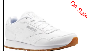
REEBOK # CM9203 WHITE/GUM OUTSOLE

CL HARMAN RUN: Leather upper. Brand logo detail hits throughout. Soft fabric lining and footbed. Textured gum rubber outsole. Shipping Wt. 32oz, Privil: A/B-1/SHU-1.