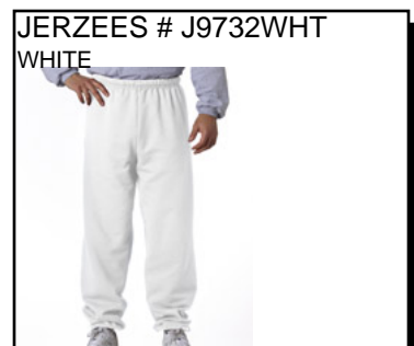
JERZEES # J9732WHT WHITE

SWEAT SHIRT: Preshrunk 50% cotton/50% polyester. 8-oz. Spill-resistant fleece. Seamless body with set-in sleeves. Double-needle cover-stitched collar. Ship. Wt. 17oz. Privil. A/B-2, SHU/PSU-2 Sizes: Men's: 2XL - 4XL $14.99