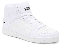
Puma # 36957303 WHITE/BLACK

REBOUND LAYUP HIGH: Classic mid-cut basketball inspired trainer. Synthetic leather upper combined with a durable cupsole tooling ensures a comfortable and supportive fit. Sizes: Men's: 7-12,13 $62.99