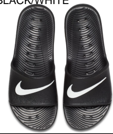
NIKE # 832528001 BLACK/WHITE

KAWA SLIDE: One-piece injected Phylon sports massage slide for the ultimate in lightweight comfort at an incredible price. Whole sizes only.