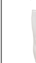
INDER # I822DRT NATURAL (Extra Heavy Tall)

WAFFLE KNIT: Long John. Extra Heavy. 9.1 oz. Rated for Extreme Cold. Rib Cuffs. 50% Cotton/50% Polyester. Ship. Wt. 18oz. Privil. A/B-2, SHU/PSU-2