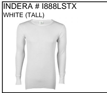
INDERA # I888LSTX WHITE (TALL)

LONG JOHN TALL TOP: 9.1 oz. Rated for Extreme Cold. Rib Cuffs. 50% Cotton/50% Polyester. Ship. Wt. 18oz. Privil. A/B-2, SHU/PSU-2