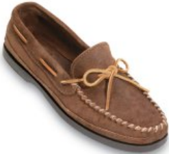
MINNETONKA # 823 BROWN SUEDE

LARIAT MOCCASIN: Double bottom hard sole slipper. Suede leather upper. Rubber sole with heel to toe cushion insole.