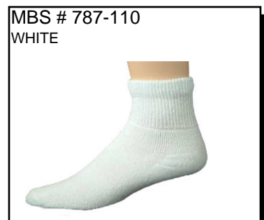
MBS # 787-110 WHITE

ANKLE: Full cushion cotton foot for extra comfort. Contents: 88% cotton/10% polyester/2% other. Ship. Wt. 5oz. Privil. A/B-7, SHU/PSU-6