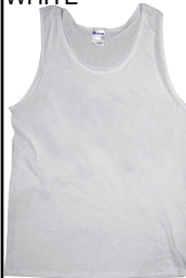
Players # P401X WHITE

COTTON TANK TOP: 100% combed cotton material. Shrinkage controlled and sizing for a comfortable fit. Made in the USA. 2 PCS/PKG.