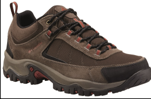
COLUMBIA # 1723831231 BROWN/BLACK/RED

GRANITE RIDGE LOW: Waterproof suede & textile upper. Fully lined. Techlite light weight midsole. Midsole ports for ventilation. Non marking rubber outsole. Sizes: Men's: 7-12,13,14,15 $64.99