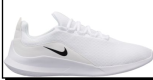
NIKE # AA2181100 WHITE/BLACK

VIALE: Rubber sole. Ultra-light design inspired by marathon runners. Mesh upper allows for breathability. Outsole lugs help optimize stability.