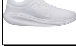
NIKE # AO0268100 WHITE

ACMI: Avail: MAY 2019. Light weight training. Low top lace up with padded collar. Pull tab. Ultra sock like feeling. Shipping Wt. 32oz, Privil: A/B-1/SHU-1.