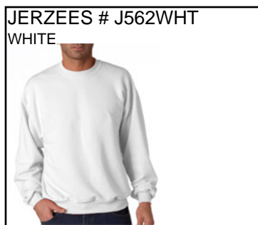
JERZEES # J562WHT WHITE

L.S. T-SHIRT: Preshrunk 50% cotton, 50% polyester jersey. 5.6-oz. Seamless body and crew neck. Ribbed cuffs. Shoulder-to-shoulder taping. Double needle bottom hem. Ship. Wt. 13oz. Privil. A/B-5, SHU/PSU-2 Sizes: Men's: 2XL - 3XL $9.99