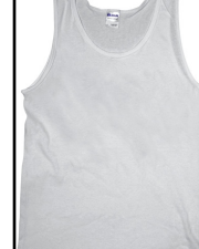
Players # P400TX WHITE

COTTON TANK TOP TALL: 100% combed cotton material. Shrinkage controlled and Sizing for a comfortable fit. Made in the USA. 2 PCS/PKG.