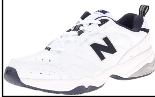
N.B. # MX624WN2 WHITE/NAVY/GRAY

CROSSTRAINER: Leather upper. Padded collar & tongue. EVA midsole. ex-grooves for superb flexibility. Rubber outsole for durability. **WIDTH: D, 2E, 4E, 6E)