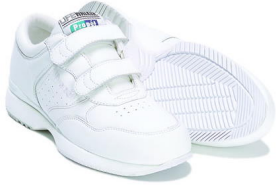
PROPET # M3705W WHITE/BLUE/TEAL

LIFE WALKER VELCRO: Light weight, leather upper, padded collar and tongue. Velcro strap. Orthotic insole. Arch support. ** WIDTH: D,E,3E,5E **