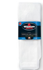
WIGWAM # S1004-051 WHITE

SUPER 60 TUBE: Cotton athletic sock in all over calf length. Welt top. Cushion insole. 3 pair per pack. 85% cotton, 15% stretch nylon.