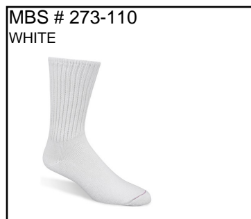
MBS # 273-110 WHITE

CREW: Full cushion cotton foot for extra comfort. Contents: 88% cotton/10% polyester/2% other. Ship. Wt. 5oz. Privil. A/B-7, SHU/PSU-6