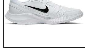
NIKE # BQ3198100 WHITE/BLACK

TODOS: Trainers feature a one piece foam midsole for underfoot cushioning and comfort, complete with a perforated toe box for enhanced breathability.