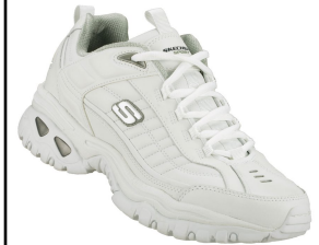
SKECHERS # 50081W WHITE/GRAY

AFTERBURN: Soft leather upper for breathability and comfort. Rubber outsole, EVA midsole for durability. ** Width: M, XW **