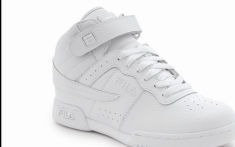
FILA # 1VF059LX100 WHITE

F13: Leather upper. Perforated toe box and quarter panel. Hook-and-loop ankle strap. embroidered logo. Padded tongue and collar.