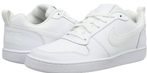
NIKE # 838937111 WHITE