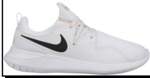
NIKE # AA2160104 WHITE/BLACK

TESSEN: Mesh upper with synthetic overlay. Comfortable sockliner. Flex grooves are hot-knife cut into the outsole for better flexibility. Shipping Wt. 32oz, Privil: A/B-1/SHU-1