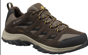
COLUMBIA # 1765391255 TAN/BLK/YEL/BRN (Medium&Wide)

CRESTWOOD WP: Suede & synthetic upper. Seam-sealed, waterproof membrane, dry and breathable. Lightweight midsole Non-marking rubber outsoles. Sizes: Men's: 7-12,13-15 $64.99