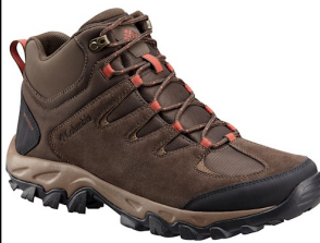
COLUMBIA # 1790971231 BROWN/RUST/BLACK

BUXTON MID: Breathable upper. Lightweight midsole. Omni-Grip non-marking traction rubber outsole. Suede, mesh, textile upper. Fabric lining. Waterproof. Sizes: Men's: 7-12,13-15 $69.99