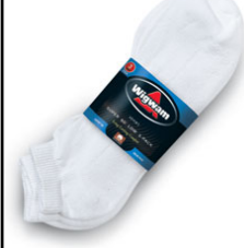
WIGWAM # S1032-051 WHITE

SUPER 60 LOW: Cotton athletic sock in low cut length. Welt top. Cushion sole. 3 pair per pack. 86% cotton, 14% stretch nylon.