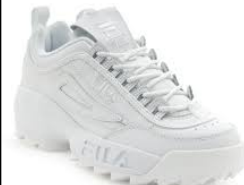
FILA # 1SX60023100 WHITE

DISRUPTOR: Molded rubber outsole. Combination leather and synthetic upper. Unique eyerow detailing. Embroidered logo.