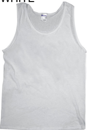
Players # P400X WHITE

TANK TOP: 100% Cotton. Sizing for a comfortable fit. Made in USA. 2 PCS/PKG.