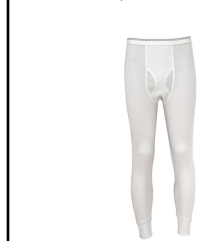
INDER # I822DRTX NATURAL (Extra Heavy - Tall)

WAFFLE KNIT: Long John. Extra Heavy. 9.1 oz. Rated for Extreme Cold. Rib Cuffs. 50% Cotton/50% Polyester. Ship. Wt. 18oz. Privil. A/B-2, SHU/PSU-2