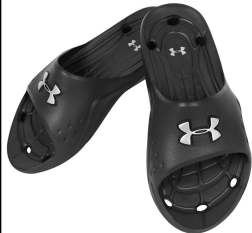
Under Armour # 1287325001 BLACK/WHITE

M LOCKER III: Quick drying one-piece performance molded EVA engineered to transport water away from the foot. Shipping Wt. 16oz, Privil: A/B-1/SHU-1