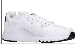
NIKE # CD5461100 WHITE/BLACK