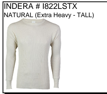
INDERA # I822LSTX NATURAL (Extra Heavy - TALL)

WAFFLE KNIT: Long John. Extra Heavy. 9.1 oz. Rated for Extreme Cold. Rib Cuffs. 50% Cotton/50% Polyester. Ship. Wt. 18oz. Privil. A/B-2, SHU/PSU-2