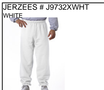
JERZEES # J9732XWHT WHITE

SWEAT PANTS: Preshrunk 50% cotton/50% polyester, 8-oz. Spill-resistant fleece. Covered elastic waistband. Elastic bottom leg. No pockets. Ship. Wt. 18oz. Privil. A/B-2, SHU/PSU-2 Sizes: Men's: M - XL $13.99