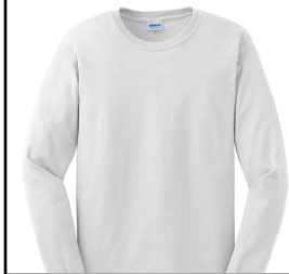
GILDAN # G2400X WHITE

L.S. T-SHIRT: Preshrunk. 100% cotton jersey, 6-oz. double-needle 7/8" collar. Taped neck & shoulders. Rib-knit cuffs. Double-needle bottom hem. Ship. Wt. 13oz. Privil. A/B-5, SHU/PSU-3 Sizes: Men's: 2XL-5XL $12.99