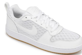
NIKE # 916760101 WHITE/GUM MESH

COURT BORO LO: Leather and mesh for durability. Padded collar keeps it comfortable. Rubber outsole. Cupsole construction in the midsole provides flexibility.