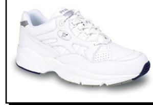
PROPET # M2034W WHITE/GRAY/BLUE

STABILITY WALKER: Leather uppers. Nylon lining. Padded collar & tongue. A5500 Diabetic Approved. ** WIDTH: B, D, E, 3E, 5E **