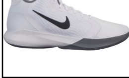
NIKE # AQ7495100 WHITE/GRAY/BLACK

NIKE PRECISION III: All-purpose mid-top. Cushioning and containment, with a lightweight midsole and circular traction pattern for support and control.