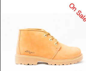
MIKE'S # 7505-100 TAN NUBUCK

CHUKKA BOOT: Full Grain Leather. Light weight & flexible. Oil and abrasion resistant. Fully lined. Waterproof. SUPPLY LIMITED-PLEASE LIST ALTERNATIVES Sizes: Men's: 7-11,12,13 $45.00