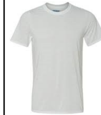
Players # P201X WHITE

COTTON CREW TEE: 100% combed cotton material shrink resistant. Machine wash warm. Made in the USA. 2 PCS/PKG.