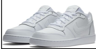
NIKE # AQ1775100 WHITE

EBERNON LOW: Retro BB sneaker in low top. Stitching at the vamp and panels. Faux leather upper. Padded tongue and collar. Mesh lining.