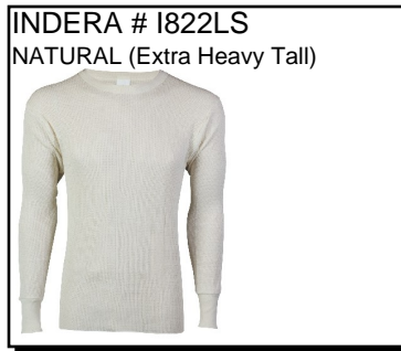
INDERA # I822LS NATURAL (Extra Heavy Tall)

WAFFLE KNIT: Long John. Extra Heavy. 9.1 oz. Rated for Extreme Cold. Rib Cuffs. 50% Cotton/50% Polyester. Ship. Wt. 18oz. Privil. A/B-2, SHU/PSU-2