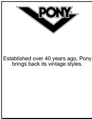
PONY # PP1794 WHITE/BLACK