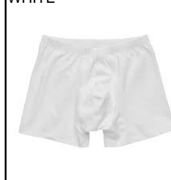
Players # P450X WHITE

BOXER: 50% cotton and 45% polyester. Shrink resistant, machine wash warm. Made in the USA. 2 PCS/PKG.