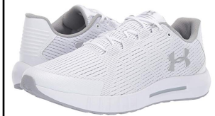
Under Armour # 3021953100 WHITE/GRAY

PURSUIT BP: For runners who need a balance of flexibility. Lightweight mesh upper delivers breathability. Foam padding your ankle collar & under the tongue.