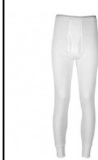
INDER # I286DRWX WHITE

ICETEX: 7.5 oz. 100% HydroPur Inside - 100% Cotton Outside. Heavyweight. Wicks moisture. Added cotton for comfort. Scent blocking. Rib cuffs. Ship. Wt. 18oz. Privil. A/B-2, SHU/PSU-2 Sizes: Men's: 2XL - 3XL $14.99