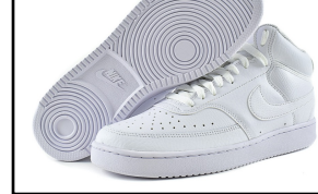
NIKE # CD5466100 WHITE

COURT VISION MID: Baby brother to Air Force 1. Stitching at the vamp and panels. Leather upper. Padded tongue and collar. Mesh lining. LIST ALTERNATIVES !!