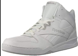
REEBOK # CN8645 WHITE/GRAY

ROYAL BB4500H2: Leather & mesh upper, Support and breathability. Mid-cut design for added stability. Support around the ankles. ** WIDTH: D, 4E **