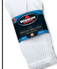
WIGWAM # S1067-051 WHITE

SUPER 60 CREW: Cotton athletic sock in crew length. Welt top. Cushion sole. 3x1 moc rib. 3 pair per pack. 85% cotton, 15% stretch nylon.