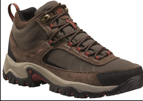
COLUMBIA # 1723841255 BROWN/BLACK/RED

GRANITE RIDGE MID WP: Waterproof. Suede and textile upper. Fully lined. Techlite light weight midsole. Ports for ventilation. Non marking rubber outsole. Sizes: Men's: 7-12,13-15 $69.99