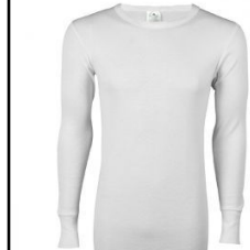
INDER # I286LSW WHITE

ICETEX: 100% HydroPur Inside - 100% Cotton Outside. Heavyweight. Wicks moisture. Added cotton for comfort. Scent blocking. Rib cuffs. 8.0 oz Ship. Wt. 18oz. Privil. A/B-2, SHU/PSU-2 Sizes: Men's: M - XL $12.99