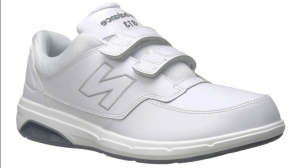
N.B. # MW813HWT WHITE/GRAY

WALKER 813 VELCRO: Leather upper. Padded Collar. Lightweight. Fabric lining. Diabetic and Medicare Approved. ** WIDTH: D, 2E, 4E **