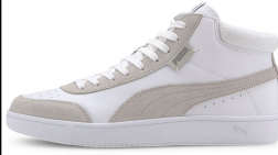
Puma # 371119-01 WHITE/GRAY

LEDGENT: Mid top Basketball. Leather & Suede upper. Cup sole. Not marking outsole. Padded Collar.