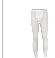
INDER # I822DRX NATURAL (Extra Heavy)

WAFFLE KNIT: Long John. Extra Heavy. 9.1 oz. Rated for Extreme Cold. Rib Cuffs. 50% Cotton/50% Polyester. Ship. Wt. 18oz. Privil. A/B-2, SHU/PSU-2