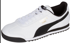
Puma # 370968-01 WHITE/BLACK

ROMA: The original. Debuted in 1968. Geared for sprints and hurdles. Leather upper. Padded tongue. Arch support.