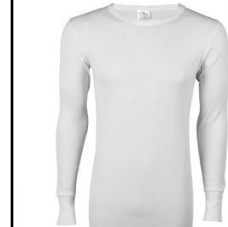
INDER # I286LSWX WHITE

ICETEX: 100% HydroPur Inside - 100% Cotton Outside. Heavyweight. Wicks moisture. Added cotton for comfort. Scent blocking. Rib cuffs. 8.0 oz Ship. Wt. 18oz. Privil. A/B-2, SHU/PSU-2 Sizes: Men's: 2XL - 3XL $14.99