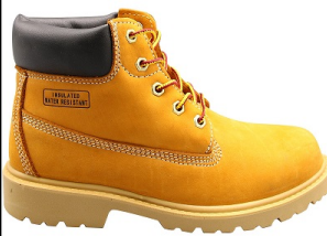
MIKE'S # 1925 WHEAT NUBUCK

CROSS GENDER BOOT: Insulated. Waterproof. Full grain leather. Flexible. Oil and abrasion resistant. An update to the B7661-100. Boys Size 3.5-7, Women Size 5.5-9