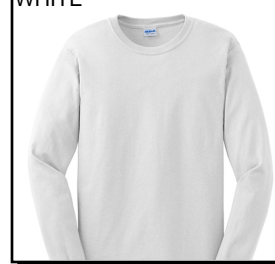
GILDAN # G2400 WHITE

L.S. T-SHIRT: Preshrunk. 100% cotton jersey, 6-oz. double-needle 7/8" collar. Taped neck & shoulders. Rib-knit cuffs. Double-needle bottom hem. Ship. Wt. 13oz. Privil. A/B-5, SHU/PSU-3