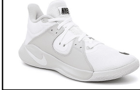
NIKE # CD0189100 WHITE/GRAY/BLACK

FLY BY MID: Synthetic uppers with a faux leather midfoot saddle. A mid-profile basketball silhouette that provides support and durability. Padded tongue and collar. Soft and breathable fabric linings.