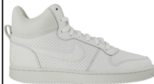
NIKE # 838938111 WHITE