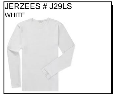
JERZEES # J29LS WHITE

L.S. T-SHIRT: Preshrunk 50% cotton, 50% polyester jersey. 5.6-oz. Seamless body and crew neck. Ribbed cuffs. Shoulder-to-shoulder taping. Double needle bottom hem. Ship. Wt. 13oz. Privil. A/B-5, SHU/PSU-2 Sizes: Men's: M - XL $6.99