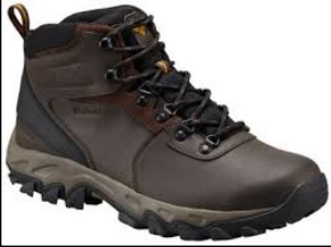
COLUMBIA # 1594732231 BROWN/BLACK

NEWTON RIDGE PLUS: Leather, suede & mesh upper. Waterproof seam-sealed. Lightweight midsole for comfort, superior cushioning, & high energy return. Non-marking rubber outsole. Sizes: Men's: 7-12,13,14,15 $69.99