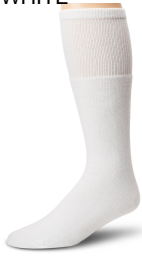
MBS # 823-110 WHITE

TUBE: 85% cotton, 15% Nylon. Full cushion construction. Fits shoe size 6-15. Ship. Wt. 5oz. Privil. A/B-7, SHU/PSU-6