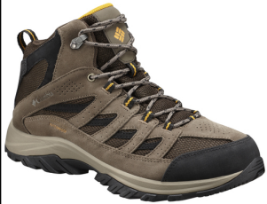
COLUMBIA # 1765381231 BROWN/YELLOW

CRESTWOOD MID WP: Breathable upper. Lightweight midsole. Omni-Grip non-marking traction rubber outsole. Leather, mesh, textile upper. Fabric lining. Waterproof. Sizes: Men's: 7-12,13-15 $69.99