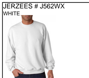
JERZEES # J562WX WHITE

SWEAT SHIRT: Preshrunk 50% cotton/50% polyester. 8-oz. Spill-resistant fleece. Seamless body with set-in sleeves. Double-needle cover-stitched collar. Ship. Wt. 17oz. Privil. A/B-2, SHU/PSU-2 Sizes: Men's: M - XL $9.99