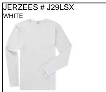
JERZEES # J29LSX WHITE

L.S. T-SHIRT: Preshrunk 50% cotton, 50% polyester jersey. 5.6-oz. Seamless body and crew neck. Ribbed cuffs. Shoulder-to-shoulder taping. Double needle bottom hem. Ship. Wt. 13oz. Privil. A/B-5, SHU/PSU-2 Sizes: Men's: M - XL $6.99