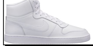
NIKE # AQ1773100 WHITE

EBERNON MID: Retro BB sneaker. Stitching at the vamp and panels. Faux-leather upper. Lightly padded tongue and collar with breathable mesh fabric.