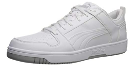
Puma # 36986603 WHITE/GREY

REBOUND LAYUP HIGH: Classic mid-cut basketball inspired trainer. Synthetic leather upper combined with a durable cupsole tooling ensures a comfortable and supportive fit. Sizes: Men's: 7-12,13 $62.99