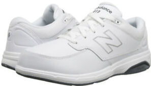
N.B. # MW813WT WHITE/GRAY

WALKER 813 LACE: Leather upper. Padded Collar. Lightweight. Fabric lining. Diabetic and Medicare Approved. ** WIDTH: B, D, 2E, 4E, 6E **