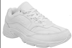
FILA # 1SG30002100 WHITE

WORK SHIFT: Leather upper. Memory foam insole. Slip resistant outsole. Light weight walking and duty shoe. **WIDTH: M, W **