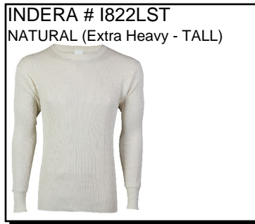
INDERA # I822LST NATURAL (Extra Heavy - TALL)

WAFFLE KNIT: Long John. Extra Heavy. 9.1 oz. Rated for Extreme Cold. Rib Cuffs. 50% Cotton/50% Polyester. Ship. Wt. 18oz. Privil. A/B-2, SHU/PSU-2