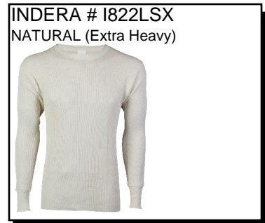
INDERA # I822LSX NATURAL (Extra Heavy)

WAFFLE KNIT: Long John. Extra Heavy. 9.1 oz. Rated for Extreme Cold. Rib Cuffs. 50% Cotton/50% Polyester. Ship. Wt. 18oz. Privil. A/B-2, SHU/PSU-2