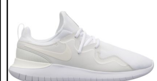
NIKE # AA2160101 WHITE

TESSEN: Mesh upper with synthetic overlay. Comfortable sockliner. Flex grooves are hot-knife cut into the outsole for better flexibility. Shipping Wt. 32oz, Privil: A/B-1/SHU-1