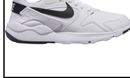
NIKE # AT4249101 WHITE/BLACK