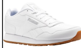
REEBOK # CM9203 WHITE/GUM

CL HARMAN RUN: Leather upper. Brand logo detail hits throughout. Soft fabric lining and footbed. Textured gum rubber outsole.