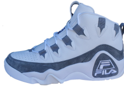
FILA # 1BM01253103 WHITE/GRAY

GRANT HILL: Leather, Suede and Textile Upper. Embroidered logo hits on tongue and midsole. Cushioned heel collar. Perforated toe box white midsole and tonal outsole.