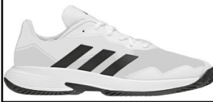
ADIDAS # GW2984 WHITE/BLACK

COURT JAM CONTROL: Flexible Bounce midsole. Breathable mesh upper. Non-marking hard court outsole and stabilizing Torsion System.