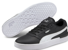
Puma # 38110901 BLACK/WHITE

CLASICO: Fabric Lining. Cushioned Insole. Flexible and lightweight outsole. Rubber Sole. Faux leather. Synthetic/Man-Made.