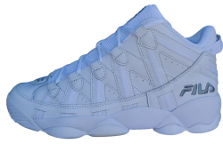
FILA # 1BM01252103 WHITE/GRAY

STACKHOUSE, JERRY: Leather, Textile and Synthetic Upper. FILA logos on heel counter. Padded tongue and collar. Pull tab on heel.