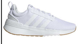
ADIDAS # GX4208 WHITE/GUM

RACER TR21: Textile upper. Soft feel runing style. Cloudfoam midsole. Textile lining. Rubber outsole. Primegreen-50% of the upper is recycled content.