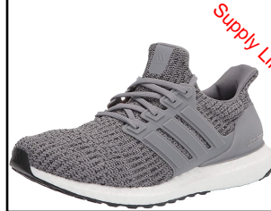
ADIDAS # FY9319 GRAY/WHITE/BLACK