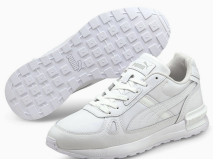
Puma # 38272102 WHITE

GRAVITON PRO L: Synthetic upper multi purpose sneaker. None marking rubber outsole.