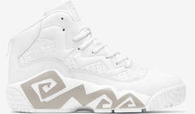
FILA # 1BM01833101 WHITE/GRAY

MASHBURN: Leather, textile, synthetic upper. Embroidered logos on quarter, tongue, toe box, and back counter. Iconic midsole design. Padded collar and tongue.