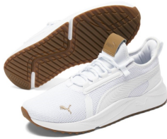
Puma # 39436101 WHITE/GUM