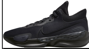
NIKE # DD9304001 BLACK

RENEW ELEVATE: Flat, stable heel, flexibility under the toes and side-to-side support. High-abrasion honeycomb mesh and durable overlays. Stable Support.