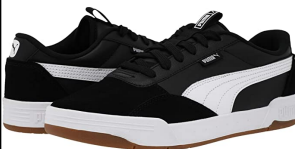
Puma # 38146101 BLACK/WHITE/GUM

C-SKATE MIX: Training. Leather and mesh upper. Padded collar. EVA midsole Full thick rubber outsole.