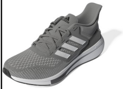
ADIDAS # GW6723 GRAY/WHITE/BLACK

EQ21 RUN: Running sneaker. A breathable upper keeps feet feeling cool. Lightweight cushioning. Made with recycled content.