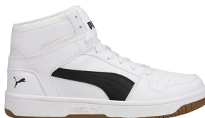
Puma # 36957324 WHITE/BLACK/GUM

REBOUND LAYUP MID: leather & synthetic upper. high-top Basketball. Overlay accents and the signature PUMA branding. Cushioned insole. Rubber outsole.