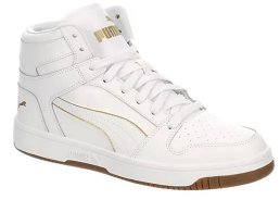
Puma # 38823801 WHITE/GUM

REBOUND LAYUP LUX: The padded support, cupsole and durable leather design ensure a secure fit, while the SoftFoam+ footbed cushioned against impacts.