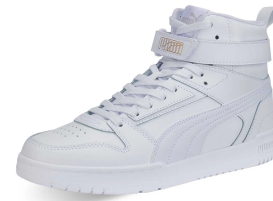
Puma # 38583902 WHITE/GOLD

RBD GAME: Basketball. Synthetic lthr upper combined with a mid cut padded collar and tongue ensures a supportive fit. Stapless. Rubber outsole.