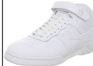
FILA # 1VF059LX100 WHITE

F13: Leather upper. Perforated toe box and quarter panel. Hook-and-loop ankle strap. embroidered logo. Padded tongue and collar.