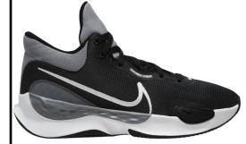
NIKE # DD9304003 BLACK/WHITE/GRAY

RENEW ELEVATE: Flat, stable heel, flexibility under the toes and side-to-side support. High-abrasion honeycomb mesh and durable overlays. Stable Support.