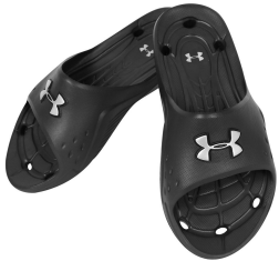
Under Armour # 1287325001 BLACK/WHITE

M LOCKER: One-piece performance molded EVA engineered to transport water away from the foot. (WHOLE SIZE ONLY).