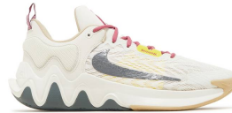
NIKE # DM0825100 WHITE/GRAY/YELLOW/RED

GIANNIS IMMORTALITY: Flat, stable heel, flexibility under the toes and side-to-side support. High-abrasion honeycomb mesh and durable overlays. Stable Support.