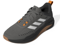
ADIDAS # GX0731 GRAY/ORANGE.GUM

TRAINER V: Training. Breathable mesh upper. Cushioned footbed plus a padded heel for exceptional comfort n support. Rubber outsole. Heel tab adds needed stability.