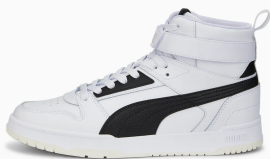
Puma # 38583901 WHITE/BLACK/GUM

RBD GAME: Basketball. Synthetic lthr upper combined with a mid cut padded collar and tongue ensures a supportive fit. Stapless. Rubber outsole.