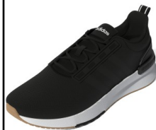
ADIDAS # GX4209 BLACK/WHITE/GUM

RACER TR21: Textile upper. Soft feel runing style. Cloudfoam midsole. Textile lining. Rubber outsole. Primegreen-50% of the upper is recycled content.