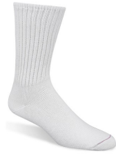
MBS # 273-110 WHITE

CREW: Full cushion cotton foot for extra comfort. Contents: 88% cotton/10% polyester/2% other. Ship Wt. 32oz, Privil: A/B-1/SHU-1