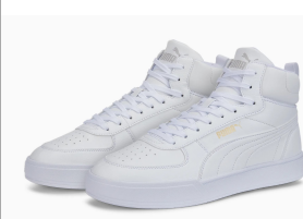
Puma # 38584301 WHITE/GOLD

CAVEN MID: Leather & syntehtic upper. Round toe. Lace-up vamp. Logo detail. Textile lining. Rubber outsole.