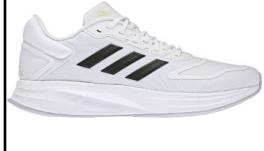
ADIDAS # GW8348 WHITE/BLACK

DURAMO 10: Regular fit. Supportive no-sew overlays. Soft heel. Lightweight cushioning. Rubber outsole. Upper contains a minimum of 50% recycled content.