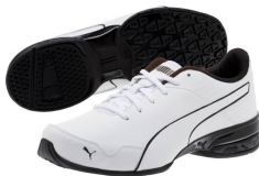
Puma # 19097401 WHITE/BLACK

SUPER LEVITATE: A synthetic leather upper with TPU at the midfoot and an EVA heel pod provides superior cushioning, comfort, and support throughout your workout.