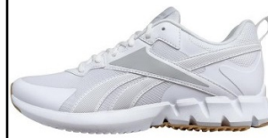
REEBOK # HQ1509 WHITE/GRAY/GUM