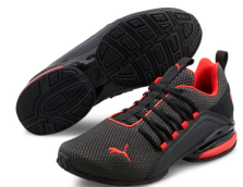
Puma # 19438401 BLACK/RED

EXELION LS: Exaggerated lacing and bold, athletic branding. SoftFoam+: Puma's comfort sockliner for instant step-in and long-lasting comfort that provides soft cushioning. Foam heel unit.