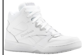
REEBOK # CN4107 WHITE/GRAY ( D,4E )

ROYAL BB4500H2: Leather and mesh upper for a blend of support and breathability. Mid-cut design for added stability and support around the ankles.