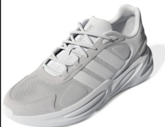
ADIDAS # GX4691 WHITE/GRAY

OZELLE: Running. The thick design lines and sturdy outsole are well-matched by the soft Cloudfoam midsole, which adds springiness to your run.