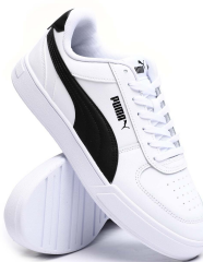
Puma # 38081002 WHITE/BLACK

CAVEN: Synthetic leather upper. Rubber Midsole and Outsole. Perforated toe box. PUMA Logo at tongue and heel.