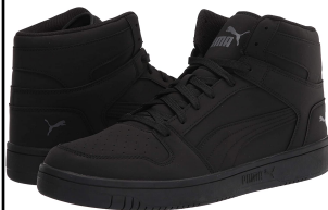
Puma # 38127701 BLACK/BLACK/GRAY

REBOUND LAYUP NB: Vamp perforations and signature formstripe exhibit the iconic basketball look, while the SoftFoam+ sockliner offers excellent cushioning.