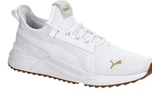
Puma # 38823601 WHITE/GUM

PACER FUTURE: Lightweight EVA material for a lifted rubber heel for swift and sturdy stepping. Knit fabric upper. Rubber outsole.