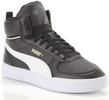
Puma # 38584302 BLACK/WHITE/GOLD

CAVEN MID: Leather & syntehtic upper. Round toe. Lace-up vamp. Logo detail. Textile lining. Rubber outsole.