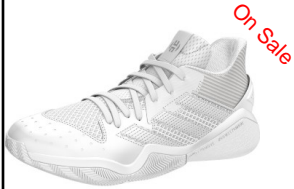
ADIDAS # FW8488 WHITE/GRAY