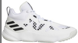
ADIDAS # GW0147 WHITE/BLACK

PRO N3NT 2021: Rubber sole. Lightweight, indoor B-ball shoes with a locked-down feel. Textile upper offers durability and comfort.