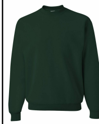
MBS # J562FGRN FORREST GREEN

SWEAT SHIRT: Preshrunk 50% cotton/50% polyester. 8-oz. Spill-resistant fleece. Seamless body with set-in sleeves. Double-needle cover-stitched collar.