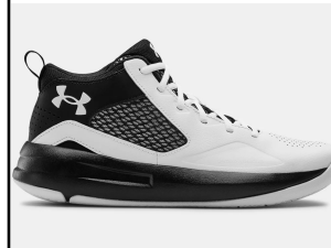
Under Armour # 3023949100 WHITE/BLACK

LOCKDOWN 5: Basketball. Solid rubber outsole with a herringbone traction pattern delivers grip. Lightweight upper. Plush sockliner for comfort. Mesh tongue.