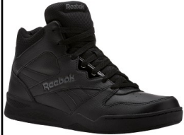
REEBOK # CN4108 BLACK ( D,4E )

ROYAL BB4500 HI2: Leather and mesh upper for a blend of support and breathability. Mid-cut design for added stability and support around the ankles. EVA sockliner.