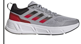
ADIDAS # GY2263 SILVER/RED/BLACK

QUESTAR: Running. Good ankle support and have a nice cushioned feel. Lightweight n provide good flexibility. Made with recycled materials.