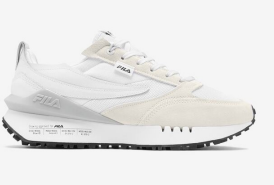
FILA # 1RM01968101 WHITE/GRAY/BLACK

RENNO n PATCHED: Leather, suede and nylon upper. Midsole cushioning for added comfort. Logos on tongue, quarter, and back counter. Padded tongue and collar.