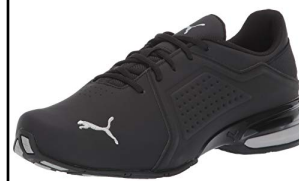
Puma # 19103705 BLACK/SILVER