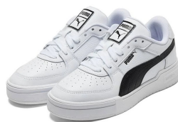
Puma # 38019003 WHITE/BLACK