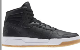
ADIDAS # FY5636 BLACK/WHITE/GUM

ENTRAP MID: Basketball inspired. Leather upper. Two tone, white and gum outsole.