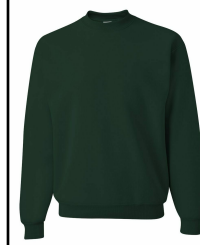
MBS # J562FGRNX FORREST GREEN

SWEAT SHIRT: Preshrunk 50% cotton/50% polyester. 8-oz. Spill-resistant fleece. Seamless body with set-in sleeves. Double-needle cover-stitched collar.