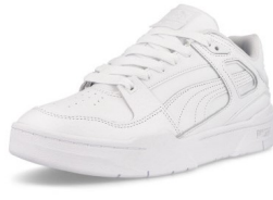
Puma # 38754402 WHITE