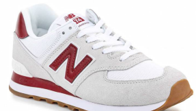
NB # ML574TE2 WHITE/RED/GUM

CLASSIC RUNNER: Vegan Leather/Suede and Mesh upper. A well-cushioned shoe offers stability and shock reduction. Rubber outsole.