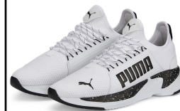
Puma # 37695702 WHITE/BLACK

SOFTTRIDE PREMIUM: Running. Slip-on features a breathable mesh upper w/ adjustable laces to fit your comfort needs. SoftFoam cushioning. Rubber outsole.