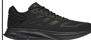
ADIDAS # GW8342 BLACK

DURAMO 10: Regular fit. Supportive no-sew overlays. Soft heel. Lightmotion cushioning. Rubber outsole. Upper contains a minimum of 50% recycled content.