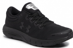
Under Armour # 3021947002 BLACK

BANDIT 5: Running shoe. Engineered mesh upper for increased ventilation. Molded comfort collar. A high-rebound EVA sockliner. Flex grooves.