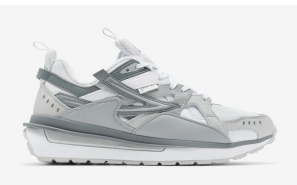
FILA # 1RM01689101 GRAY/WHITE

SANDENAL: Retro-inspired runner. Mesh base with leather and synthetic overlays. Printed tongue and heel logo. Woven quarter logo. Pull tabs on the tongue and heel.