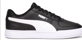
Puma # 38081004 BLACK/WHITE

PUMA CAVEN: Synthetic leather upper. Rubber Midsole and Outsole. Perforated toe box. PUMA Logo at tongue and heel.