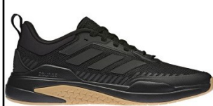
ADIDAS # GX0728 BLACK/GUM

TRAINER V: Flexible knit upper with stretch. Snug feel. Bounce midsole. Rubber outsole. Upper contains a minimum of 50% recycled content.