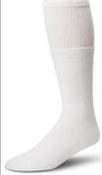
MBS # 823-110 WHITE

TUBE: 85% cotton, 15% Nylon. Full cushion construction. Fits shoe size 6-15. Ship Wt. 32oz, Privil: A/B-1/SHU-1