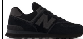
NB # ML574EVE BLACK

CLASSIC RUNNER: Vegan Leather/Suede and Mesh upper. A well-cushioned shoe offers stability and shock reduction. Rubber outsole.