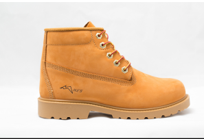
MIKE'S # 1068-100 WHEAT NUBUCK

5" BOOT: Waterproof lthr upper. Solid, light weight and flexible outsole. Oil and abrasion resistant. Fully lined. Cushion insole. Padded collar. NOTE: Metal Eyelets!!!