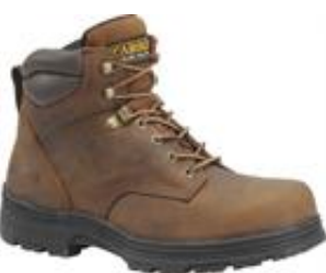
CAROLINA # CA3026 Medium & Wide Width