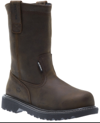
wolverine # W10682 Medium & Wide Width