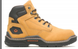
wolverine # W210064 Medium & Wide Width