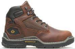
wolverine # W210065 Medium & Wide Width