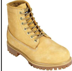
CAROLINA # CA3045 Medium & Wide Width