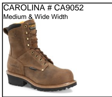
CAROLINA # CA9052