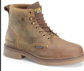
CAROLINA # CA3044 Medium & Wide Width