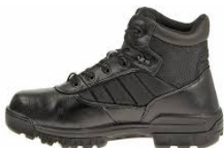
Bates # E03162 Medium & Wide Width

Bates is a brand grounded in the history of serving the people who keep us safe and the tradition of quality and value. At Bates,