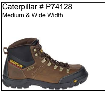
Caterpillar # P74128