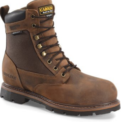
CAROLINA # CA3056 Medium & Wide Width