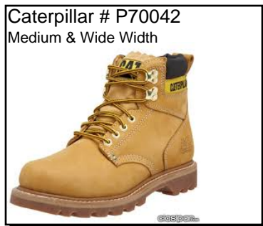
Caterpillar # P70042