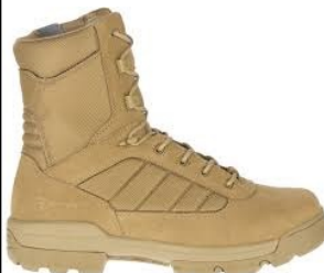
Bates # E03181 Medium & Wide Width