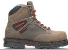
wolverine # W200158 Medium & Wide Width