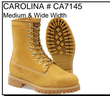
CAROLINA # CA7145