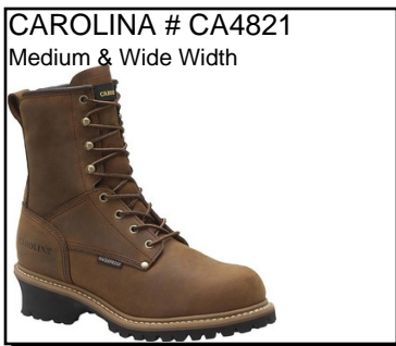
CAROLINA # CA4821