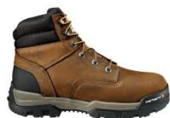
CARHARTT # CME6047 Medium & Wide Width