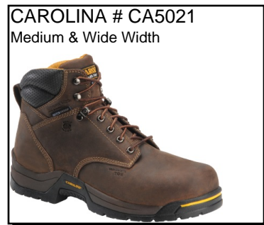
CAROLINA # CA5021