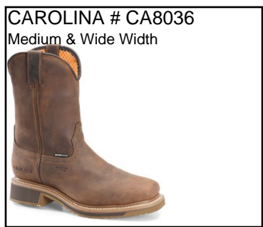
CAROLINA # CA8036