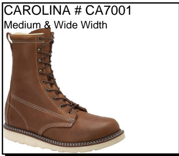
CAROLINA # CA7001