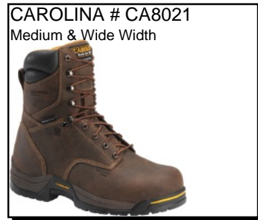
CAROLINA # CA8021