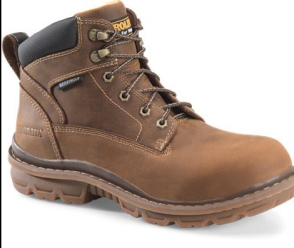
CAROLINA # CA3058 Medium & Wide Width