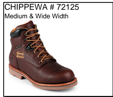
CHIPPEWA # 72125