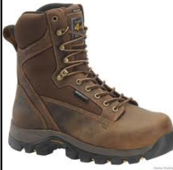
CAROLINA # CA4015 Medium & Wide Width