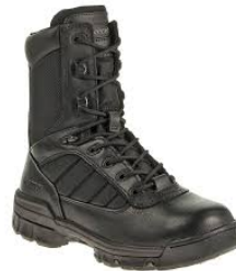
Bates # E03182 Medium & Wide Width