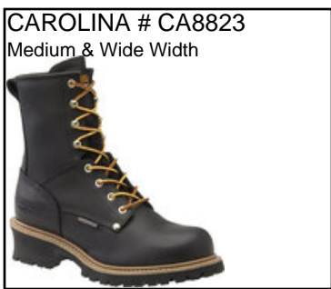
CAROLINA # CA8823