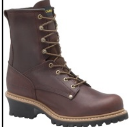
CAROLINA # 821 Medium & Wide Width

Design and build footwear to accommodate those work place differences, using industry-specific designs and sophisticated construction techniques to combine carefully chosen materials with state-of-the-art, patented technologies. Carolina – built for your work.