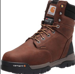
CARHARTT # CME8047 Medium & Wide Width