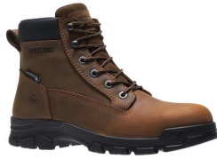
wolverine # W10917 Medium & Wide Width