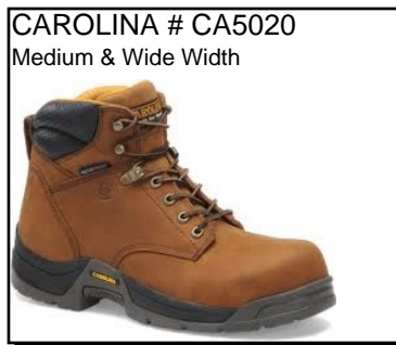
CAROLINA # CA5020