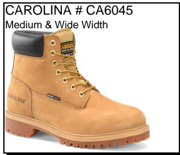
CAROLINA # CA6045