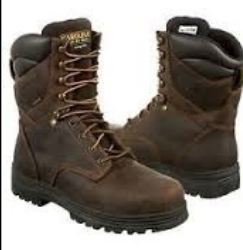
CAROLINA # CA3034 Medium & Wide Width