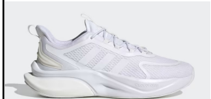
ADIDAS # HP6143 WHITE

ALPHA BOUNCE: Running-inspired. Breathable knit upper keeps feet cool. Energised cushioning for any activity. 50% recycled content. Textile lining. Ship Wt. 32oz, Privil: A/B-2/RHU-1 Sizes: Men's: 7-12,13 $79.99