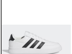
ADIDAS # HP9445 WHITE/BLACK

BREAKNET: For anything on or off the court. Synthetic upper is durable. Grippy rubber outsole provides traction on any surface. Partial recycled materials. Ship Wt. 32oz, Privil: A/B-2/RHU-1 Sizes: Women's: 5-10,11 $54.99