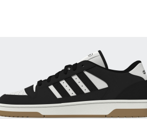
ADIDAS # IH7963 BLACK/WHITE/GUM

BREAK START: Synthetic lthr & suede upper. Basketball. loud foam midsole. Textile lining. Non-marking rubber outsole. Some recycled contents.