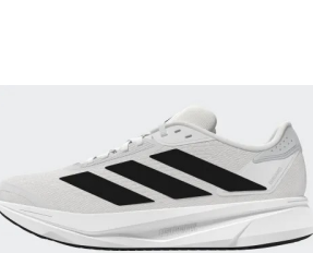
ADIDAS # IH8215 WHITE/BLACK