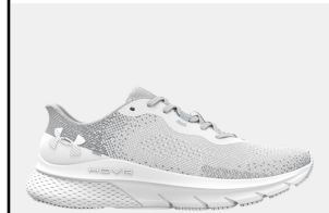
Under Armour # 3026520111 WHITE/GRAY

TURBULENCE II: Breathable knit upper. Durable & lightweight. Deluxe sockliner provides ultimate step-in comfort. Rubber outsole provides traction & durability with flexibility for toe-off.