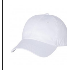
MBS # Y1503WHT WHITE

CURVED BRIM: Curved brim. Adjustable velcro strap for a proper fit. Ship Wt. 32oz, Privil: A/B-2/RHU-1