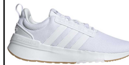
ADIDAS # GX4208 WHITE/GUM

RACER TR21: ON SALE - Availability Limited to Size 8-12,13