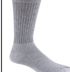
MBS # 872-102 GRAY

CREW: Full cushion cotton foot for extra comfort. Contents: 88% cotton/10% polyester/2% other. Ship Wt. 32oz, Privil: A/B-6/RHU-6