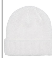
MBS # Y1501WHT WHITE

BEANIE CAP: Keep a warm head with this sturdy knit cap. 100% hypoallergenic acrylic cuffed cap. Ship. Wt. 3oz. Privil. A/B-3, RHU-2