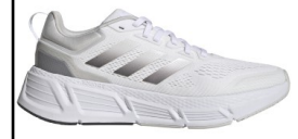
ADIDAS # GZ0630 WHITE/GRAY

QUESTAR: Double-density bounce midsole. Rubber non-marking outsole. Primegreen mesh made with 50% recycled material. Ship Wt. 32oz, Privil: A/B-2/RHU-1