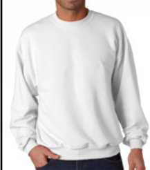
MBS # J562WHT WHITE

SWEAT SHIRT: Preshrunk 50% cotton/50% polyester. 8-oz. Spill-resistant fleece. Seamless body with set-in sleeves. Double-needle cover-stitched collar. Ship. Wt. 17oz. Privil. A/B-2, RHU-2 Sizes: Unisex: M - XL $11.99