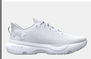
Under Armour # 3027523103 WHITE

UA INFINITE: Neutral stability provides balance. Knit uppers is breathable, durable and lightweight. Comfort system sock liners provide step-in comfort. Rubber outsoles.