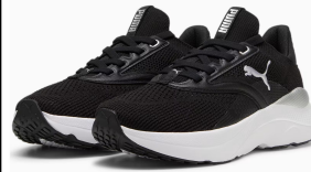
Puma # 31016001 BLACK/WHITE

SOFTTRIDE MAYVE: Availability: October 2024 Sizes: Women's: 5.5-10,11 $67.99