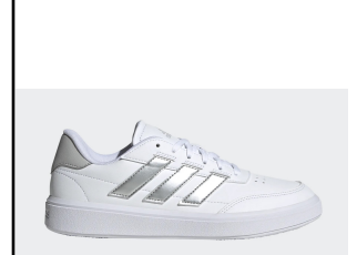
ADIDAS # IF6465 WHITE/GRAY

COURT BLOCK: Clean-lined and crisp. Cloudfoam base supports every step with pillow-soft cushioning. Synthetic upper/textile lining/rubber sole. Ship Wt. 32oz, Privil: A/B-2/RHU-1 Sizes: Women's: 5-10,11 $61.99