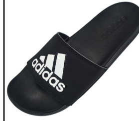
ADIDAS # CG3425 BLACK/WHITE

ADILETTE: Synthetic upper w/ Adidas Badge. Textile lining for comfort. Contoured cloudfoam. (WHOLE SIZES ONLY). We May Sub: GZ3779. Ship Wt. 32oz, Privil: A/B-2/RHU-1 Sizes: Men's: 5-16 $29.99