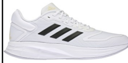
ADIDAS # GW8348 WHITE/BLACK

DURAMO 10: Regular fit. Supportive no-sew overlays. Soft heel. Lightweight cushioning. Rubber outsole. Upper contains a minimum of 50% recycled content. Ship Wt. 32oz, Privil: A/B-2/RHU-1 Sizes: Men's: 7-12,13,14,15 $62.99