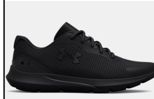
Under Armour # 3024883002 BLACK

SURGE 3: Running. 2-tone mesh upper is lightweight & breathable. Deluxe foam sockliner. Dual density Charged midsole. Solid rubber outsole.