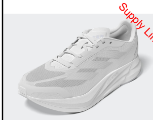
ADIDAS # IE9671 WHITE/GRAY

DURAMO SPEED: lightweight & breathable engineered mesh upper with a full length LIGHTSTRIKE midsole for faster movement and durable outsole was built for runners.