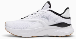
Puma # 31016002 WHITE/BLACK/GUM

SOFTTRIDE MAYVE: Mesh upper. Round toe. Lace up front. PUMA logo on side. Made w/ at least 20% recycled materials. Padded collar and tongue. Ship Wt. 32oz, Privil: A/B-2/RHU-1 Sizes: Women's: 5.5-10 $67.99