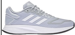
ADIDAS # GW8344 GRAY/WHITE

DURAMO 10: Running shoes. Full-length Lightmotion midsole delivers responsive cushioning. Mesh upper offers elevated comfort from the first step to the last.