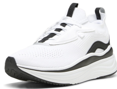
Puma # 37882703 WHITE/BLACK

SOFTTRIDE STACD: Running. Breathable upper, Cushiony softfoam and sockliner. Rubber grippy outsole. Ship Wt. 32oz, Privil: A/B-2/RHU-1