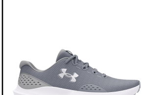
Under Armour # 3027000101 GRAY/WHITE

Charged Surge: Mesh upper for lightweight breathability. Foam padding around your ankle collar & under the tongue for an incredibly comfortable fit & feel.