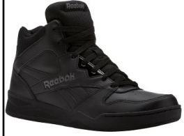
Reebok # CN4108 BLACK ( D,4E )

ROYAL BB4500 HI2: Leather and mesh upper for a blend of support and breathability. Mid-cut design for added stability and support around the ankles. EVA sockliner.