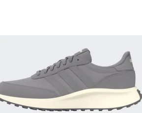
ADIDAS # JH6257 GRAY/WHITE