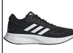
ADIDAS # GX0709 BLACK/WHITE

DURAMO 10: Regular fit. Supportive no-sew overlays. Soft heel. Lightweight cushioning. Rubber outsole. Upper contains a minimum of 50% recycled content