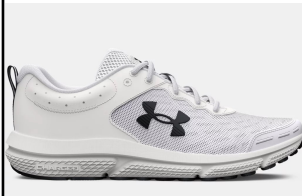
Under Armour # 3026175104 WHITE/BLACK

CHARGE ASSERT 10: Lightweight mesh upper & durable leather overlays. EVA sockliner. Cushioning midsole.