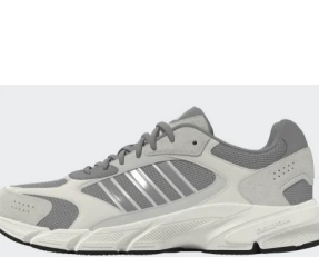
ADIDAS # JH6847 GRAY/WHITE