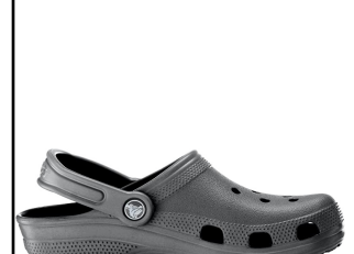
CROCS # 10001-001 BLACK

CLASSIC CLOG: Ventilation ports add breathability. Weighs ounces. Fully molded. Heel strap offers a secure fit. Odor-resistant. Whole Size Only. Please specify GENDER size. Sizes: Boys/Men's: 3-15 $44.99