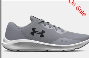
Under Armour # 3024878104 GRAY/BLACK/WHITE