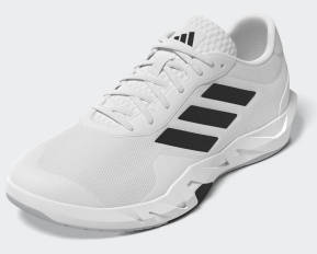
ADIDAS # IF0954 WHITE/BLACK

AMPLIMOVE TRAINER: Seamless mesh upper with welded overlays. Textile lining. TPU support overlays. Multi-directional rubber outsole. Contains recycled contents.