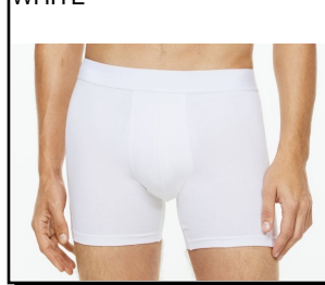
MBS # MBB123WHT WHITE

BOXER BRIEF: 3 PPK. Cotton, Polyester and Spandex bland. Relax fit. No bunching. Soft, flexible waist band. 6 inch inseam, Fly front.