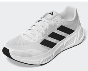
ADIDAS # IF2228 WHITE/BLACK

QUESTAR II: Recycled materials. Lightweight and breathable. Cloud foam cushioning. A molded heel provide stability. Rubber traction. Ship Wt. 32oz, Privil: A/B-2/RHU-1