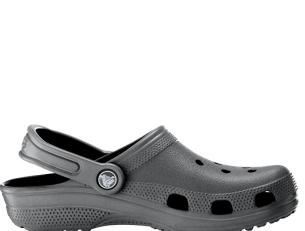
CROCS # 10001-001 BLACK

CLASSIC CLOG: Ventilation ports add breathability. Weighs ounces. Fully molded. Heel strap offers a secure fit. Odor-resistant. Whole Size Only. Please specify GENDER size.