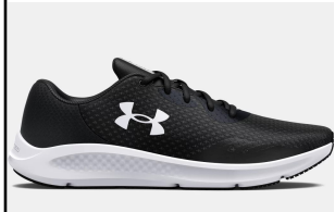
Under Armour # 3024878001 BLACK/WHITE

CHARGE PURSUIT: Mesh upper for lightweight breathability. Foam padding around your ankle collar & under the tongue for an incredibly comfortable fit & feel.