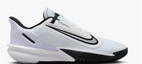
NIKE # FN4322101 WHITE/BLACK

PRECISION VII: Basketball. Low collar provides mobility at the ankle. Visible cutout in the foam helps reduce weight. No-sew overlays. Molded Swoosh. Ship Wt. 32oz, Privil: A/B-2/RHU-1 Sizes: Men's: 7-12,13,14,15 $76.99