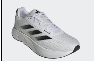
ADIDAS # IE7262 WHITE/BLACK

DURAMO SL: Supportive no-sew overlays. Soft heel. Lightweight cushioning. Rubber outsole. Upper contains 50% recycled content. Ship Wt. 32oz, Privil: A/B-2/RHU-1