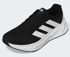
ADIDAS # IF2229 BLACK/WHITE

QUESTAR II: Recycled materials. Lightweight and breathable. Cloud foam cushioning. A molded heel provide stability. Rubber traction.