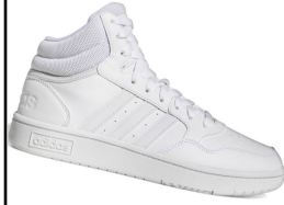
ADIDAS # GW5457 WHITE

Adidas is dedicated to the pursuit of performance. Tested technology and innovation are part of all Adidas footwear. For special requests and sizes, don't hesitate to write.