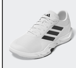
ADIDAS # IF0958 WHITE/BLACK

AMPLIMOVE TRAINER: Workout sneakers. Sleek and breathable mesh upper. Cushioning system provides optimal support and energy return. Ship Wt. 32oz, Privil: A/B-2/RHU-1 Sizes: Women's: 5-10,11 $64.99