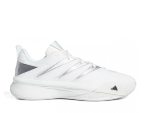
ADIDAS # IH8468 WHITE/SILVER

DAME CERTIFIED III: Damian Lillard Signature shoe. Basketball. Bounce midsole is lightweight and flexes with your foot, while the rubber outsole supports starts and stops.