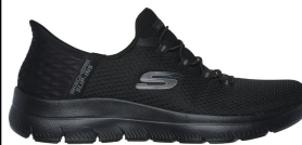
SKECHERS # 150123BBK BLACK

SUMMIT DIAMOND DREA: Slip-In. One-piece design that fits snug with bungee stretch fabric and lace accents. Memory Foam insole and durable rubber outsole. Traction rubber outsole. Ship Wt. 32oz, Privil: A/B-2/RHU-1 Sizes: Women's: 6-10 $62.99