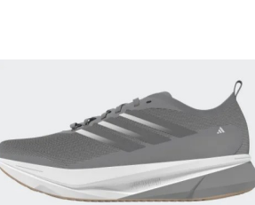
ADIDAS # JR0864 GRAY/WHITE/GUM