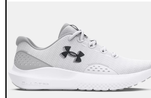
Under Armour # 3027000100 WHITE/BLACK/GRAY

CHARGE SURGE: Mesh upper for lightweight breathability. Foam padding around your ankle collar & under the tongue for an incredibly comfortable fit & feel.