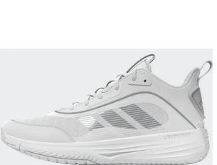
ADIDAS # JR6671 WHITE/GRAY