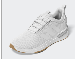
ADIDAS # ID2718 WHITE/GRAY/GUM

RACER TR23: Flexile upper. 50% recycled content. Rear pull tab. Cloud oam midsole with rubber outsole provides traction and stability. Ship Wt. 32oz, Privil: A/B-2/RHU-1 Sizes: Men's: 7-12,13,14 $72.99