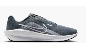
NIKE # FD6454010 Lt. GRAY/WHITE

DOWNSHIFTER 13: Availability: April 2025