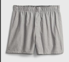
MBS # MB234GRY GRAY

SWEAT PANTS: Preshrunk 50% cotton/50% polyester, 8-oz. Spill-resistant fleece. Covered elastic waistband. Elastic bottom leg. No pockets. Ship. Wt. 17oz. Privil. A/B-2, RHU-2 Sizes: Unisex: 2XL - 3XL $24.99