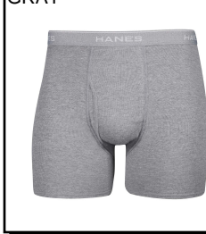
MBS # MBB123GRY GRAY

BOXER BRIEF 3PPK: 3 PPK. Cotton, Polyester and Spandex bland. Relax fit. No bunching. Soft, flexible waist band. 6 inch inseam, Fly front.