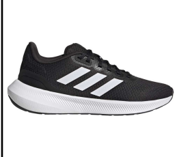
ADIDAS # HP7556 BLACK/WHITE

RUNFALCON: Running. Cushy Cloudfoam midsole. Textile upper feels comfy and breathable. Rubber outsole. Made with recycled materials. We may substitute # HP9952. (Med. & Wide Width). Sizes: Women's: 5-10,11 $54.99