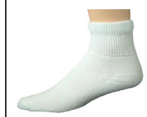
MBS # 787-110 WHITE

ANKLE: Full cushion cotton foot for extra comfort. Contents: 88% cotton/10% polyester/2% other. Ship Wt. 32oz, Privil: A/B-6/RHU-6