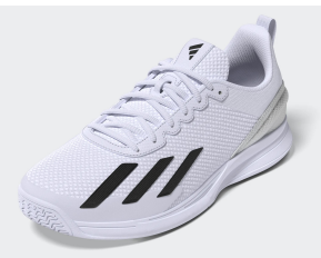
ADIDAS # IG9538 WHITE/BLACK

COURT FLASH: Lightweight, comfortable mesh upper. Multi-directional outsole grips the court. Recycled materials. Tear resistant upper material. Ship Wt. 32oz, Privil: A/B-2/RHU-1 Sizes: Men's: 8-12,13 $79.99