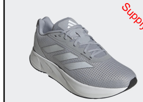
ADIDAS # IE9689 GRAY/WHITE

DURAMO SL: Supportive no-sew overlays. Soft heel. Lightweight cushioning. Rubber outsole. Upper contains 50% recycled content.