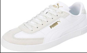
Puma # 39744706 WHITE/GUM YELLOW

CLUB ERA II: Availability: May 2025 Sizes: Women's: 5.5-10 $69.99