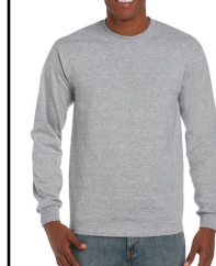
MBS # G2401XGRY LT. GRAY

L.S. T-SHIRT: Long Sleeve. Preshrunk 100% cotton jersey, 6-oz. double-needle 7/8" collar. Taped neck and shoulders. Rib-knit cuffs. Ship Wt. 32oz, Privil: A/B-5/RHU-3 Sizes: Unisex: 2XL - 5XL $18.99