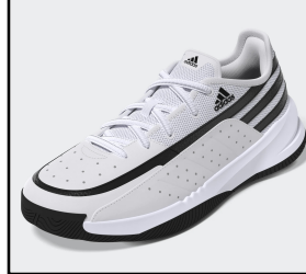
ADIDAS # ID8589 WHITE/BLACK

FRONT COURT: Court shoes. Cushioned comfort with every step. Cloudfoam midsole. Synthetic leather, coated nubuck mesh upper. Rubber outsole. Ship Wt. 32oz, Privil: A/B-2/RHU-1 Sizes: Men's: 7-12,13,14,15 $69.99