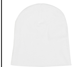
MBS # Y1500WHT WHITE

YUPOONG CAP: Keep a warm head with this sturdy knit cap. 100% hypoallergenic acrylic. Approx. 8 1/2" long. Ship. Wt. 3oz. Privil. A/B-3, RHU-2