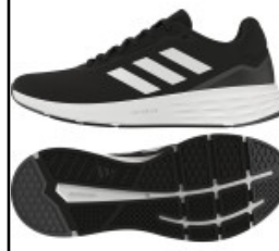
ADIDAS # GY9234 BLACK/WHITE

STARTYOURRUN: Bounce and Boost midsole. Lightweight. Mesh upper. Running. Rubber outsole.