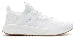
Puma # 39548209 WHITE

PACER 23: Performance trainer is w/ a bootie construction. Breathable mesh upper. Rubber traction outsole. Ship Wt. 32oz, Privil: A/B-2/RHU-1