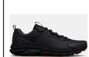
Under Armour # 3024876003 BLACK/GUM

CHARGED VERSSET: Mix-material upper with durable suede & leather overlays & breathable mesh details. EVA sockliner provides soft, step-in comfort. Rubber outsole.