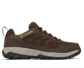
COLUMBIA # 2076891231 BROWN/TAN/BLACK/YELLOW

STRATA TRAIL LOW: Non-marking traction rubber. Lightweight & durable. Waterproof breathable construction. High energy return. Mesh and suede upper. Gusseted tongue. (Medium & Wide Width) Sizes: Men's: 7-12,13,14,15 $74.99