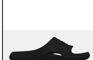
Under Armour # 3028094001 BLACK

M LOCKER: Quick drying one-piece performance molded EVA slide. Additional drainage ports. Updated cushioning & raised height for ultimate comfort. Textured footbed & outsole.