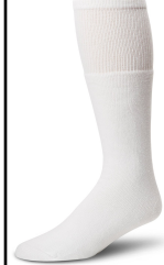
MBS # 823-110 WHITE

TUBE: 85% cotton, 15% Nylon. Full cushion construction. Fits shoe size 6-15. Ship Wt. 32oz, Privil: A/B-6/RHU-6