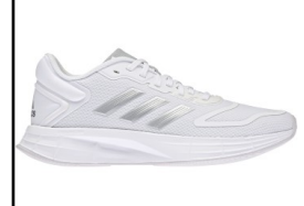
ADIDAS # GX0713 WHITE/SILVER

DURAMO 10: Running. Mesh upper. Supportive no-sew overlays. Soft heel. Rubber outsole. Upper contains 50% recycled content. Ship Wt. 32oz, Privil: A/B-2/RHU-1