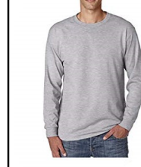
MBS # J291LSGRY LT. GRAY

L.S. T-SHIRT: Preshrunk 50/50 cotton/polyester. 5.6-oz. Seamless body and crew neck. Ribbed cuffs. Shoulder-to-shoulder taping. Double needle bottom hem. Ship Wt. 32oz, Privil: A/B-5/RHU-3 Sizes: Unisex: M-XL $14.99