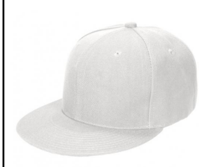
MBS # Y1502WHT WHITE

FLAT BRIM CAP: 6 panel structured cap. 100% Acrylic. Pro style high profile. Rounded flat bill shape. Adjustable snap for a proper fit. Ship. Wt. 3oz. Privil. A/B-3, RHU-2