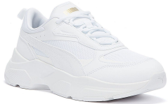
Puma # 38922301 WHITE

CASSIA VIA: Synthetic leather upper. Soft material on the midsole. Rubber outsole for perfect traction. PUMA logo. Lace closure.