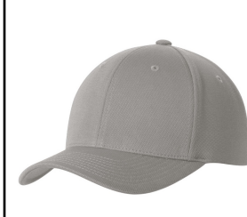
MBS # Y1503GRY GRAY

BASEBALL HAT: Curved brim. Adjustable velcro strap for a proper fit. Ship. Wt. 3oz. Privil. A/B-3, RHU-2