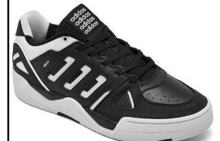
ADIDAS # IE4518 BLACK/WHITE

FRONT COURT: Court shoes. Cushioned comfort with every step. Cloudfoam midsole. Synthetic leather, coated nubuck mesh upper. Rubber outsole. Ship Wt. 32oz, Privil: A/B-2/RHU-1 Sizes: Men's: 7-12,13,14,15 $69.99