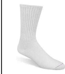
MBS # 273-110 WHITE

CREW: Full cushion cotton foot for extra comfort. Contents: 88% cotton/10% polyester/2% other. Ship Wt. 32oz, Privil: A/B-6/RHU-6