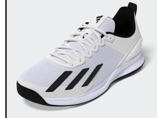
ADIDAS # IF0429 WHITE/BLACK

COURT FLASH SPEED: Designed for speed. Abrasion resistance at the to. Lightweight, breathable mesh upper. Features 20% recycled materials. Ship Wt. 32oz, Privil: A/B-2/RHU-1