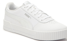
Puma # 38584902 WHITE/SILVER

CARINA: Leather upper. Padded collar for extra comfort. Logo detail on heel, tongue and upper. SoftFoam for cushioned footbed. Rubber outsole. Ship Wt. 32oz, Privil: A/B-2/RHU-1 Sizes: Women's: 5.5,10,11 $68.99