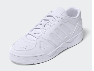
ADIDAS # IF6662 WHITE

MIDCITY LOW: Synthetic lthr & suede upper. Basketball. loud foam midsole. Textile lining. Non-marking rubber outsole. Some recycled contents. Ship Wt. 32oz, Privil: A/B-2/RHU-1 Sizes: Men's: 7-12,13,14 $71.99