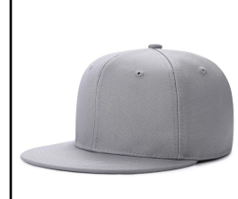
MBS # Y1502GRY GRAY

FLAT BRIM CAP: 6 panel structured cap. 100% Acrylic. Pro style high profile. Rounded flat bill shape. Adjustable snap for a proper fit. Ship. Wt. 3oz. Privil. A/B-3, RHU-2