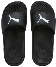
Puma # 37101604 BLACK/WHITE

COOL CAT SPORT: One piece construction. Water proof. Bold log on the instep. WHOLE SIZES ONLY. Ship Wt. 32oz, Privil: A/B-2/RHU-1