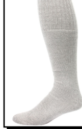
MBS # 656-102 GRAY

TUBE: 85% cotton, 15% Nylon. Full cushion construction. Fits shoe size 6-15. Ship Wt. 32oz, Privil: A/B-6/RHU-6