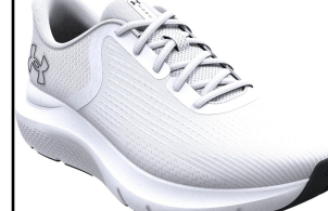
Under Armour # 3028256100 WHITE/GRAY/BLACK

UA ROGUE 5: Full-length engineered mesh upper for lightweight breathability & a close-to-foot feel. Cushioning midsole for all day comfort. Rubber outsole.