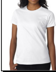
MBS # 2000LX WHITE

CREW T-SHIRT: 100% preshrunk cotton. 6-oz. Feminine fit. Taped neck&shoulders. Seamless 5/8" neck. Sleeve & bottom hems quarter-turned to eliminate crease.