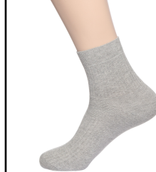
MBS # 925-102 GRAY

ANKLE: Full cushion cotton foot for extra comfort. Contents: 88% cotton/10% polyester/2% other. Ship Wt. 32oz, Privil: A/B-6/RHU-6