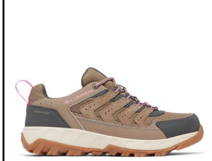
COLUMBIA # 2078551252 TAN/PINK

STRATA TRAIL LOW WP: Durable Leather and mesh combination. Waterproof construction. Techlite insole for long lasting and high energy return. (Medium & Wide Width) Sizes: Women's: 5-10,11 $74.99