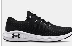
Under Armour # 3024873001 BLACK/WHITE

CHARGED VANTAGE: Light, breathable stretch-mesh upper. Molded synthetic midfoot for added durability & support. Foam sockliner.