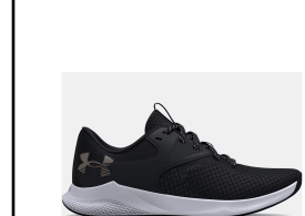
Under Armour # 3025060001 BLACK/GRAY