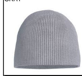
MBS # Y1500GRY GRAY

YUPOONG CAP: Keep a warm head with this sturdy knit cap. 100% hypoallergenic acrylic. Approx. 8 1/2" long. Ship. Wt. 3oz. Privil. A/B-3, RHU-2