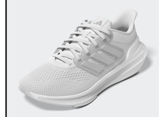
ADIDAS # HP5788 WHITE

ULTRABOUNCE: Running. Lightweight Bounce cushioning provides comfort and flexibility. Rubber outsole. Textile upper. Textile lining. Ship Wt. 32oz, Privil: A/B-2/RHU-1 Sizes: Women's: 5-10,11 $72.99