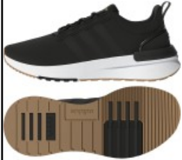
ADIDAS # GX4206 BLACK/WHITE/GUM

RACER TR21: Racing sneakers features classic 3-Stripes. Lace-up vamp. Synthetic upper/rubber sole.