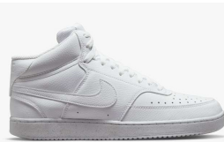
NIKE # DN3577100 WHITE

COURT VISION MID: Classic 80's hi top basketball. Recycled material. Stitched overlays. Padded collar and tongue. Cushioned insole. Traction rubber outsole. Ship Wt. 32oz, Privil: A/B-2/RHU-1 Sizes: Men's: 7-12,13,14 $86.99