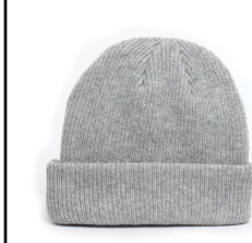
MBS # Y1501GRY GRAY

BEANIE CAP: Keep a warm head with this sturdy knit cap. 100% hypoallergenic acrylic cuffed cap. Ship. Wt. 3oz. Privil. A/B-3, RHU-2