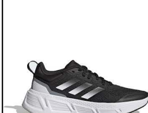
ADIDAS # GX7162 BLACK/WHITE/GRAY

QUESTAR: Combined Cloudfoam midsole and outsole are designed for an ultra-soft step with endless cushioning. Sock-like construction hugs the foot. Mesh textile upper. EVA outsole. Sizes: Women's: 5-10,11 $72.99